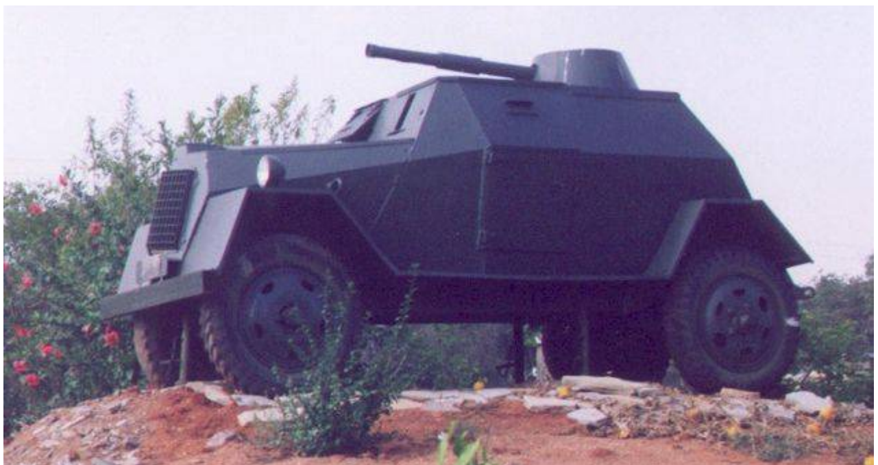
Humber LRC Mk IIIA – André Becker Collection (Belgium)

http://relics.warbirds.in/AndhraPradesh/Hyderabad/MCEME/