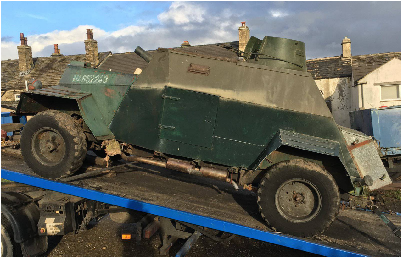
Humber Light Reconnaissance Car – Private collection (UK)

https://www.facebook.com/105747677467973/photos/rpp.105747677467973/106072700768804/