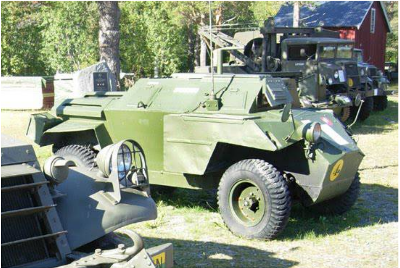
Lars Gyllenhaal, September 2010 - http://larsgyllenhaal.blogspot.com/2010_09_01_archive.html