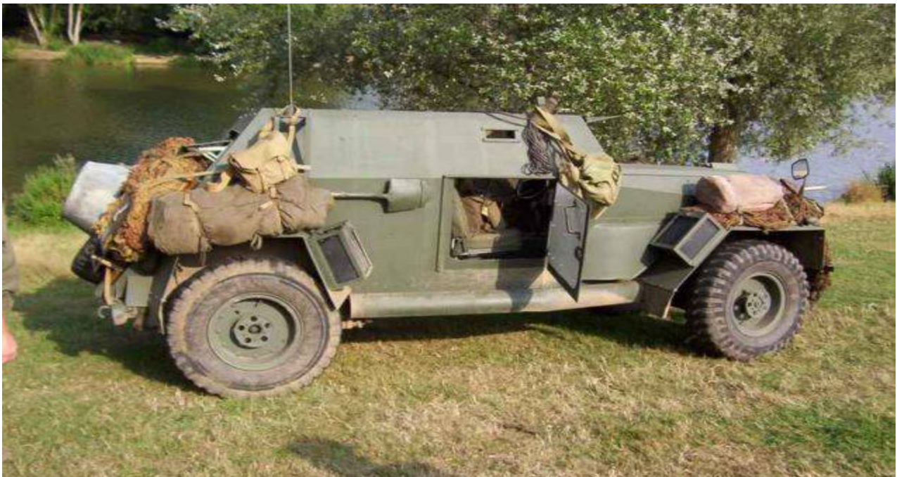
Humber Light Reconnaissance Car – Royal Air Force Museum, Hendon (UK)

http://www.asox18.dsl.pipex.com/43rlhg/main.htm