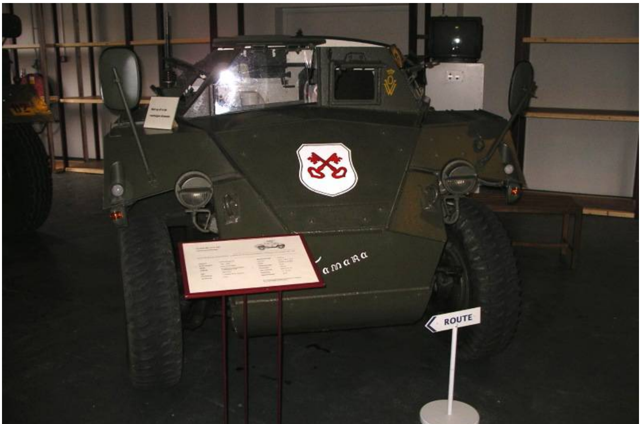
"Olaf", December 2007 - http://picasaweb.google.pl/okievit/CavalerieMuseum2007#