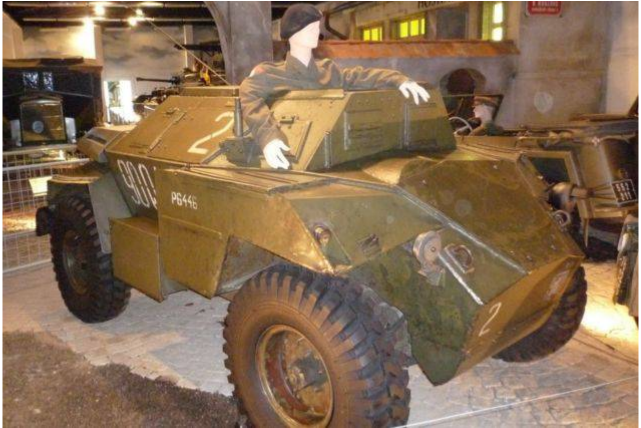
"Petr", August 2009 - http://picasaweb.google.com/petr.kral82/VojenskeMuzeumLesany#