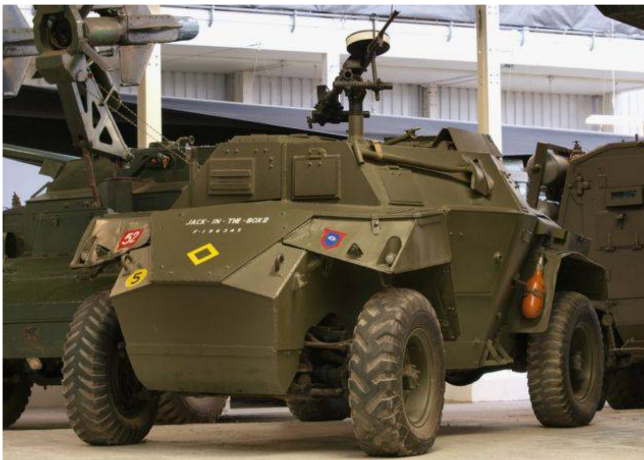
Humber Scout Car – Tilhører Veteranpanserforeningen (Denmark) This vehicle is being restored