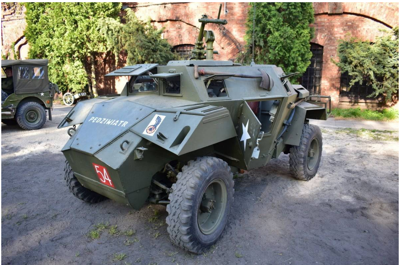
Humber Scout Car – CRCS Onlus, Santa Margherita del Gruagno, Moruzzo (Italy)

https://www.facebook.com/photo?fbid=2239694379516545&set=pcb.2013453522127227