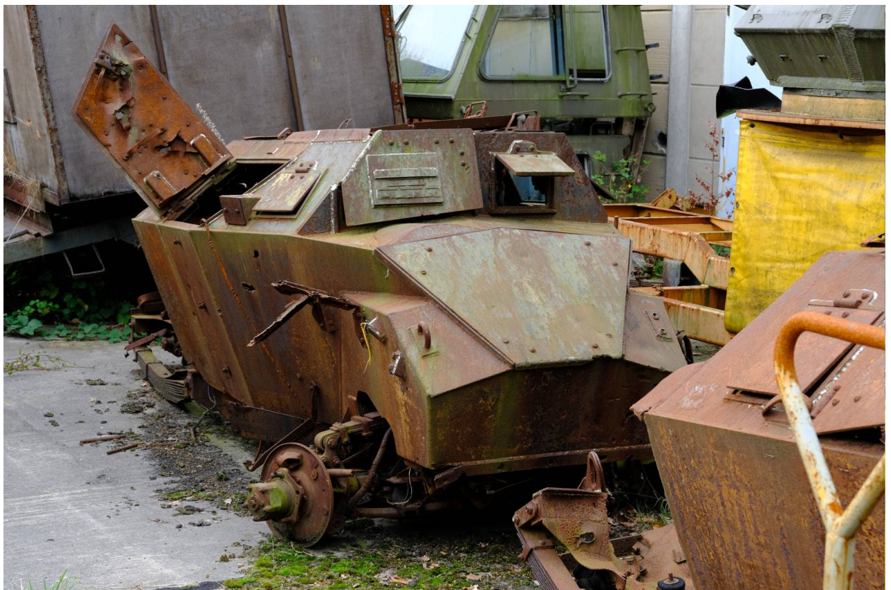
Humber Scout Car wreck – Private collection (UK)

https://www.facebook.com/566482865/posts/10159761656637866