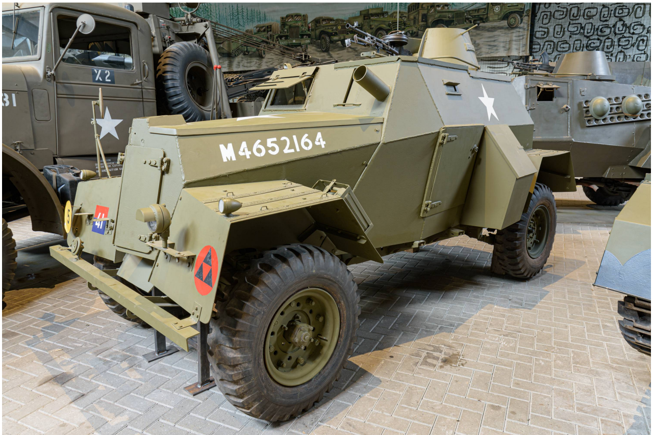
Axel Recke, December 2020