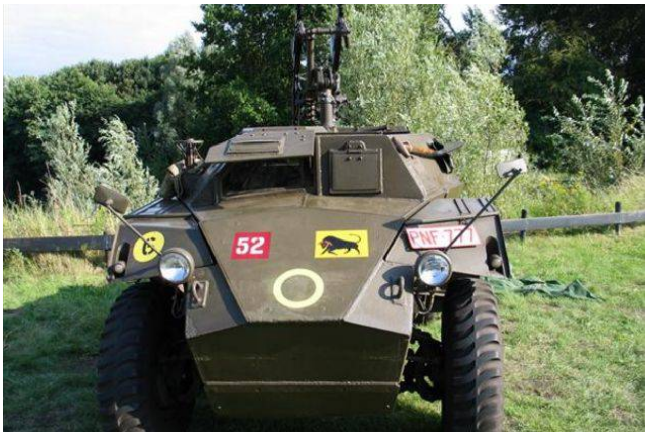
Humber Scout Car – Museum K-blokken en Oscarkapel (MKOK Museum) Leopoldburg (Belgium)