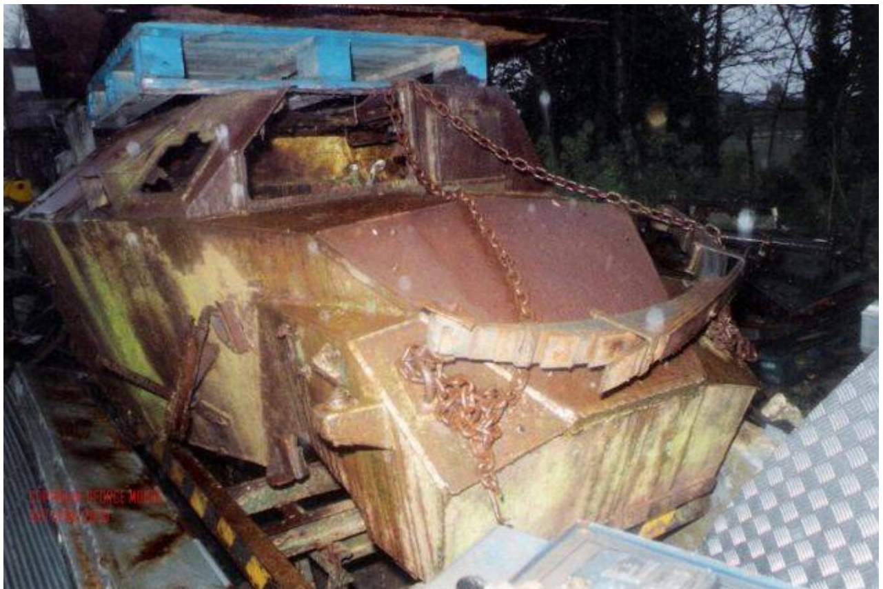
George Moore - http://www.warwheels.net/humberscoutGMOORE.html