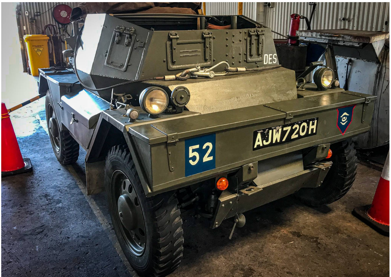
Third Daimler Dingo – Malaysian Army Museum, Port Dickson (Malaysia)