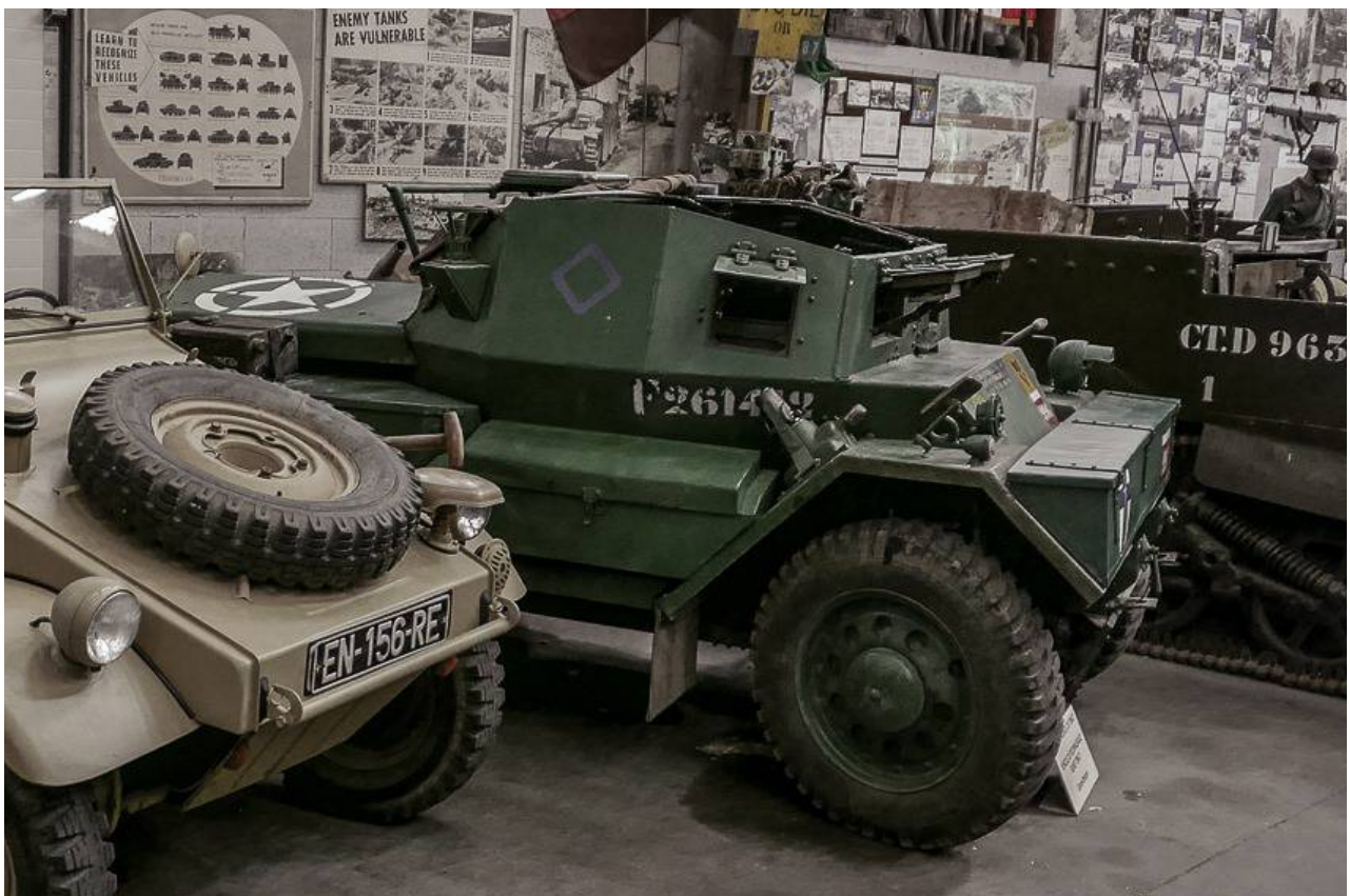
Daimler Dingo – Saumur Tank Museum (France)