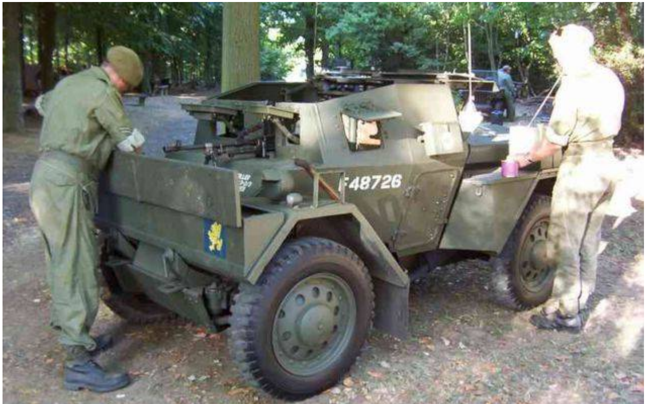
Daimler Dingo – The Museum of The King's Royal Hussars, Winchester (UK)

http://www.asox18.dsl.pipex.com/43rlhg/main.htm