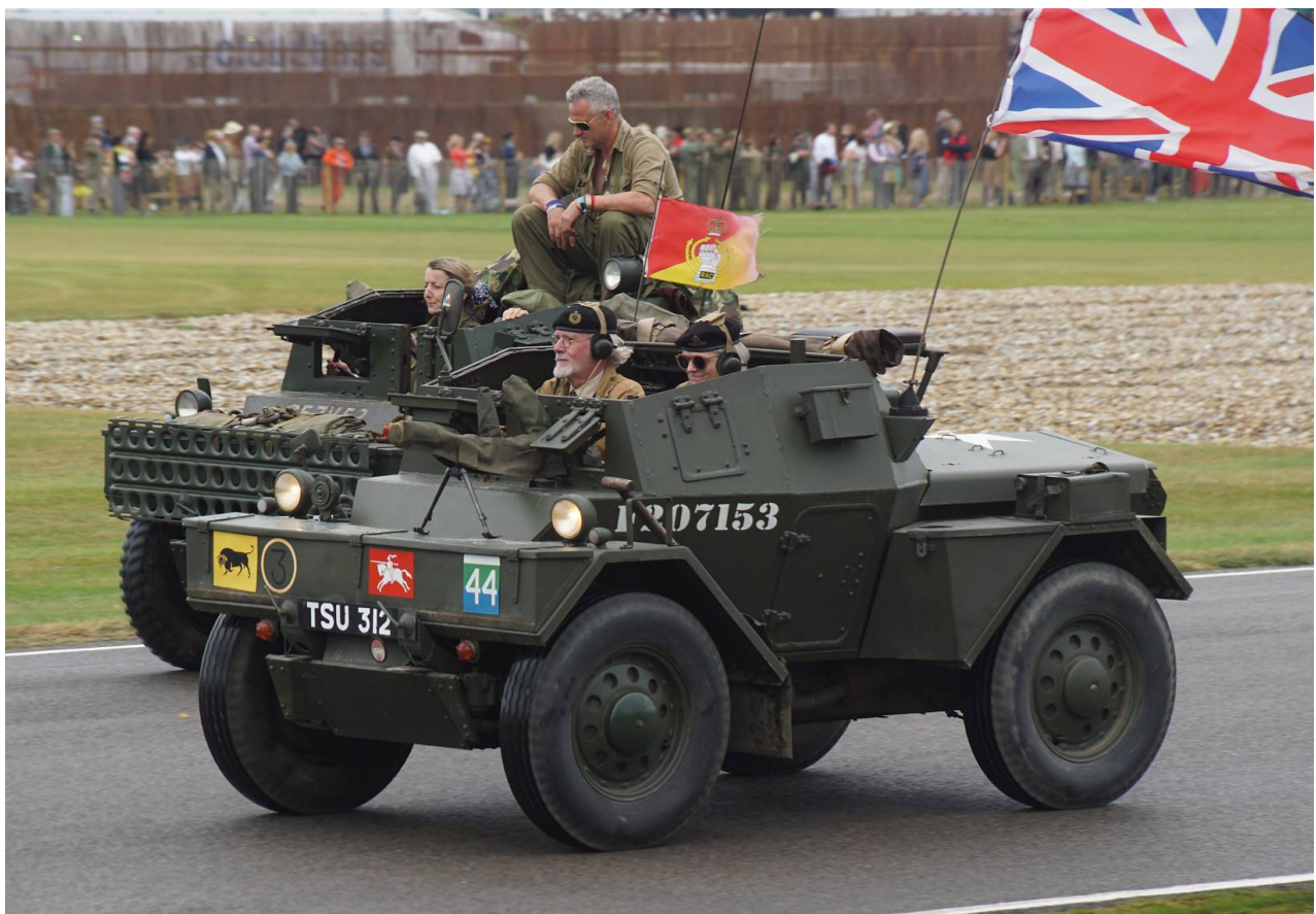
Daimler Dingo (F207077) – Private collection (UK)

https://www.flickr.com/photos/helensanders/51723488826/