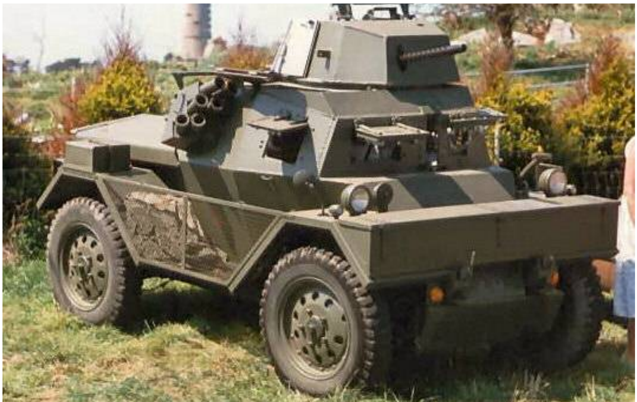
Daimler Dingo – Chaguaramas Military Museum, Diego Martin (Trinidad & Tobago)

http://www.gmv.co.uk/vehicle_details/armoured_and_tracked/daimlerdingo1941.php