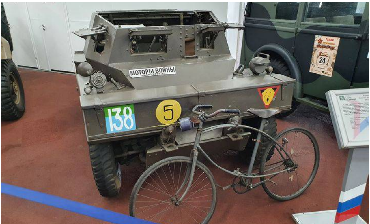
Daimler Dingo (F340824) – Royal Tank Museum, Amman (Jordan) Formerly part of the Virginia Museum of Military Vehicles, Nokesville, VA (USA)

October 2021 - https://www.facebook.com/ww2motors/photos/a.469558563128582/4333077733443293/