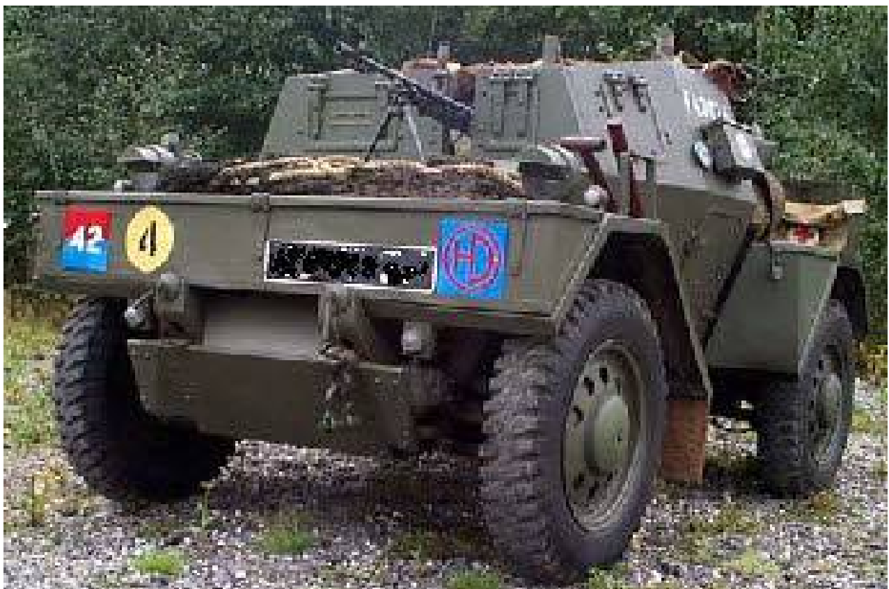
Daimler Dingo – Unknown location

http://www.daimler-fighting-vehicles.co.uk/surviving%20dsc.html