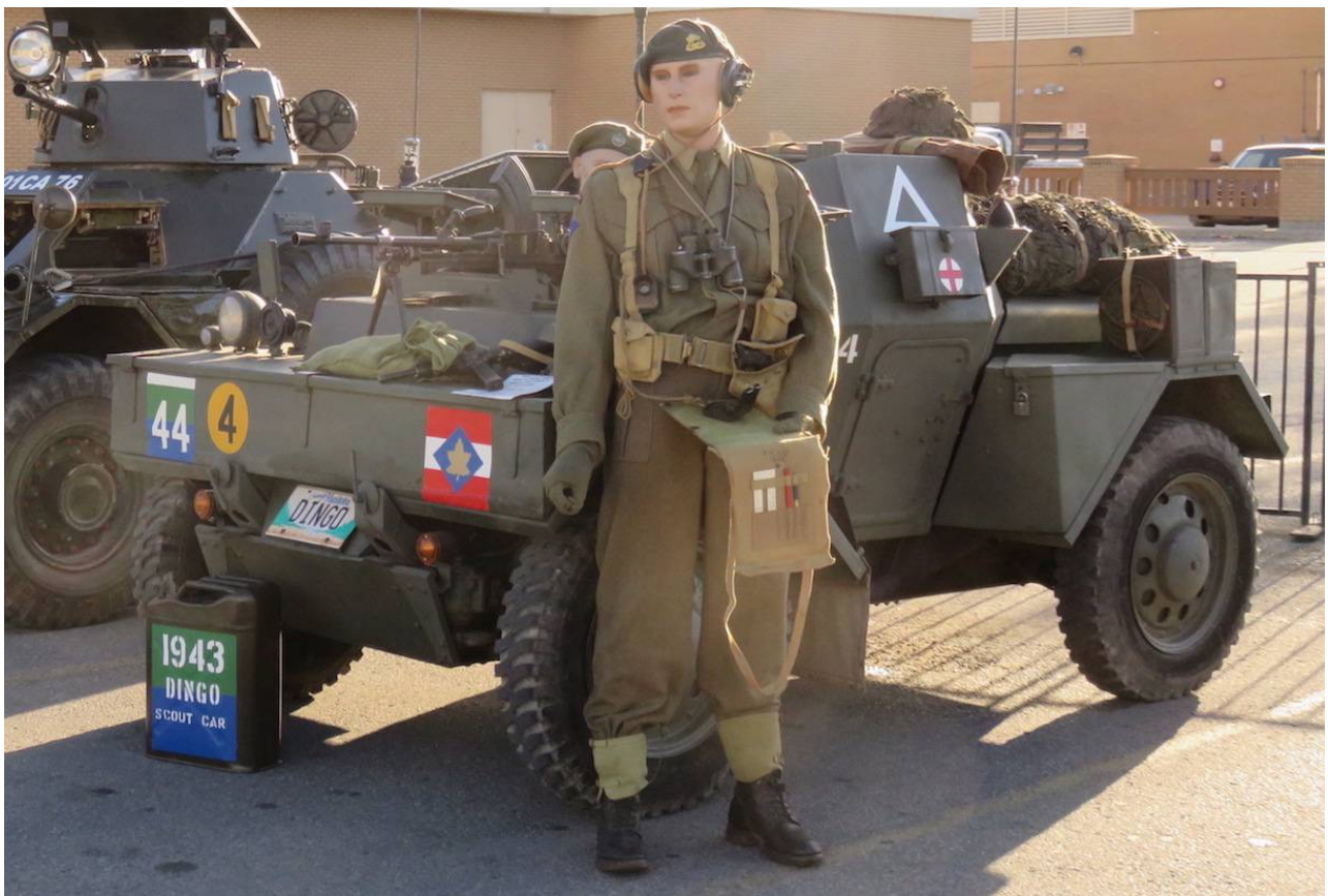
Daimler Dingo – Private collection, Ontario (Canada)