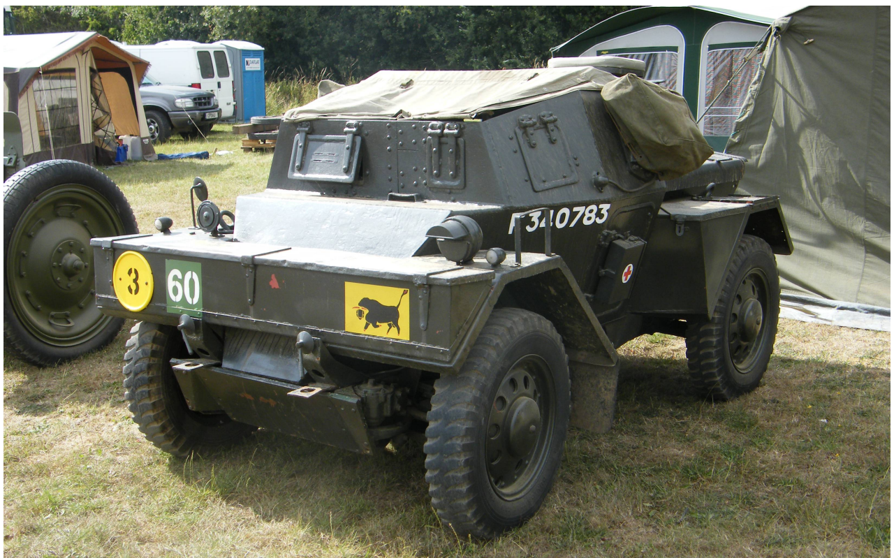
Daimler Dingo (F340750) – Private collection (UK)