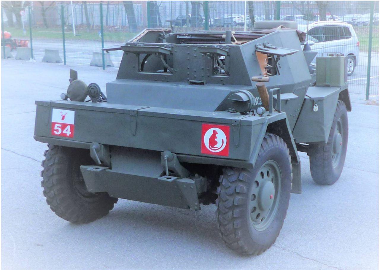
Franz Brödl, January 2019