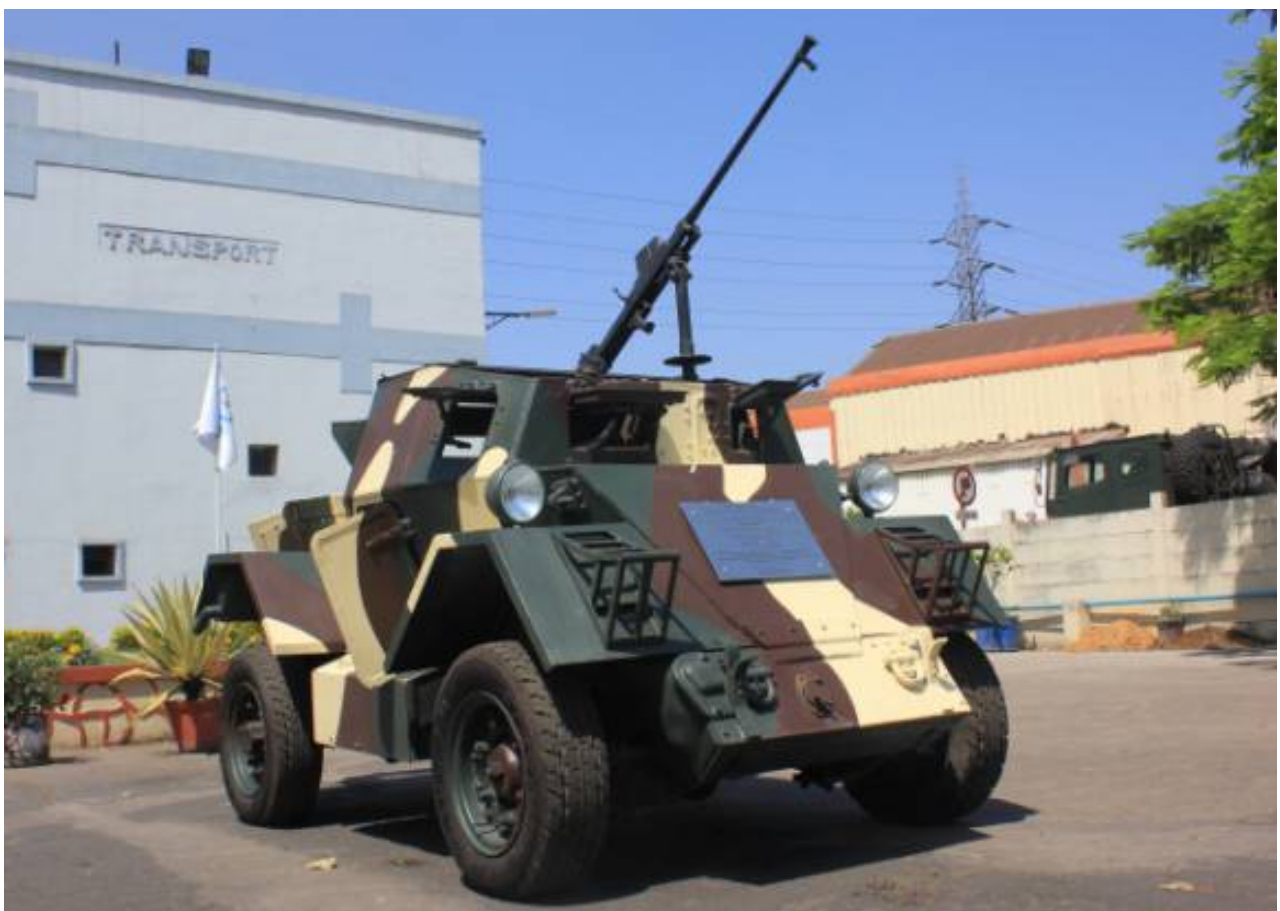
Two Ford Lynxs – Border Security Force Museum at BSF Academy, Tekanpur (India)

https://redscarabtravelandmedia.wordpress.com/tag/kolkata/