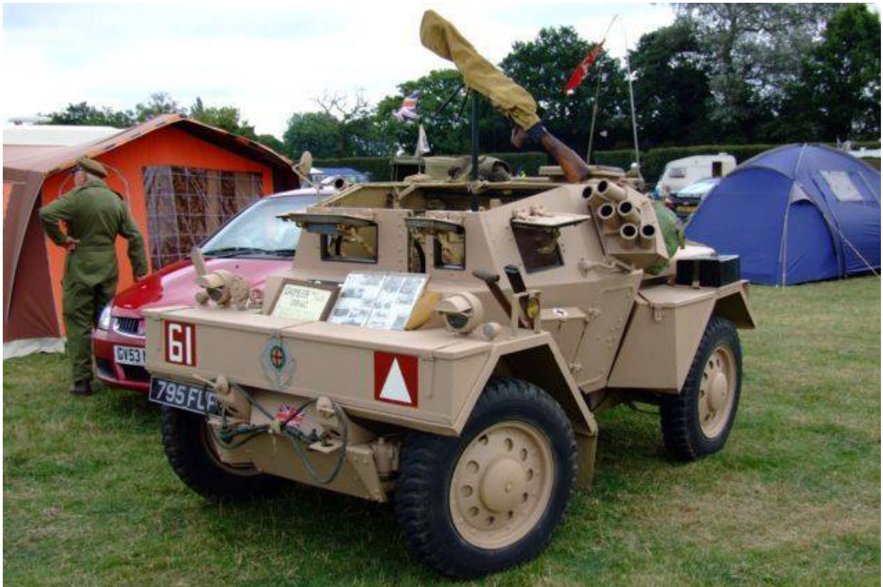
Photo taken during the Coventry Festival of Motoring 2007

"classic vehicles", August 2009 - http://www.flickr.com/photos/old_motors/4160803302/