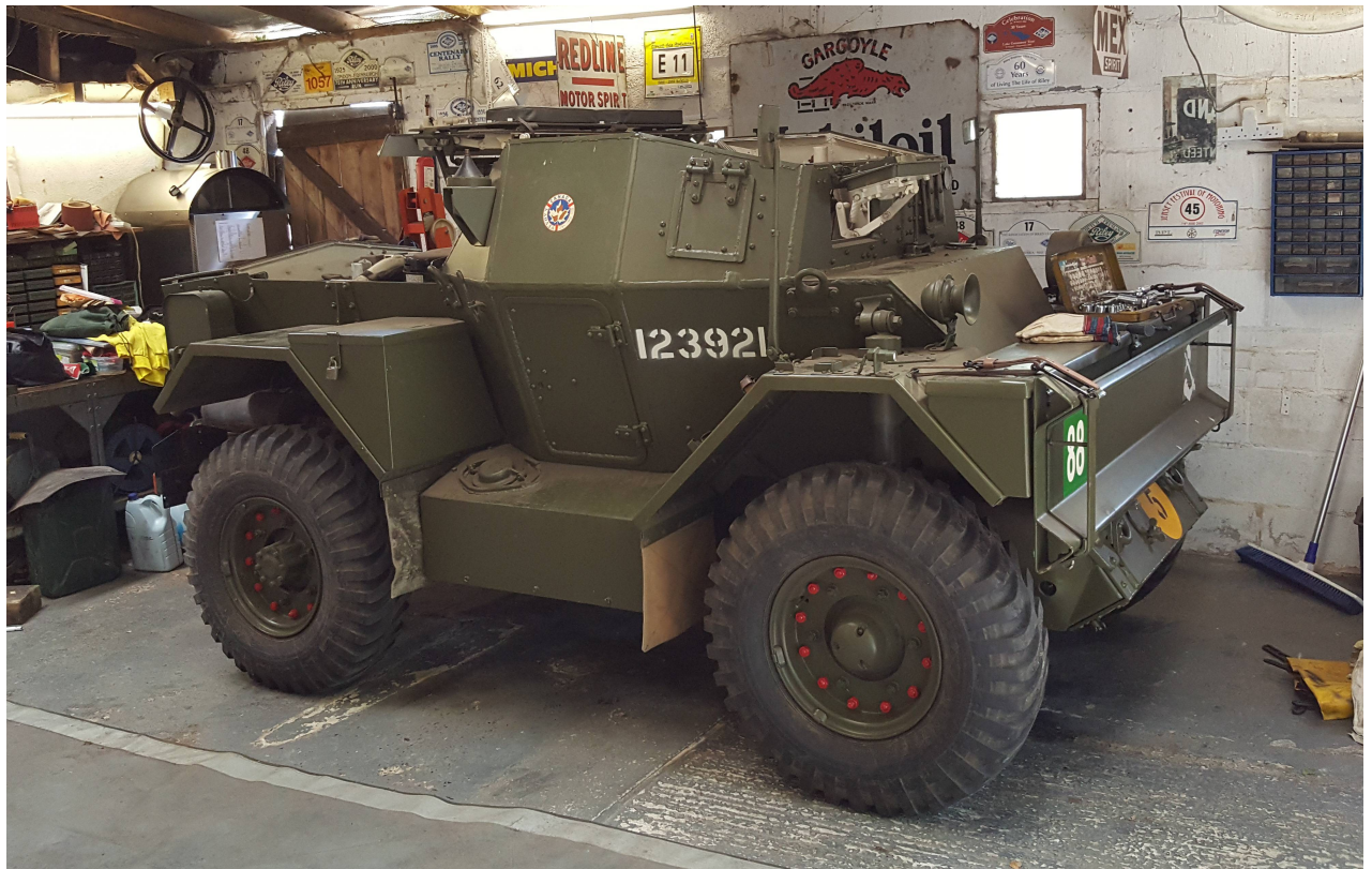
Ford Lynx – James Gosling Collection (UK)

https://www.facebook.com/photo.php?fbid=2643490579036800&set=pcb.2643491265703398&type=3&theater