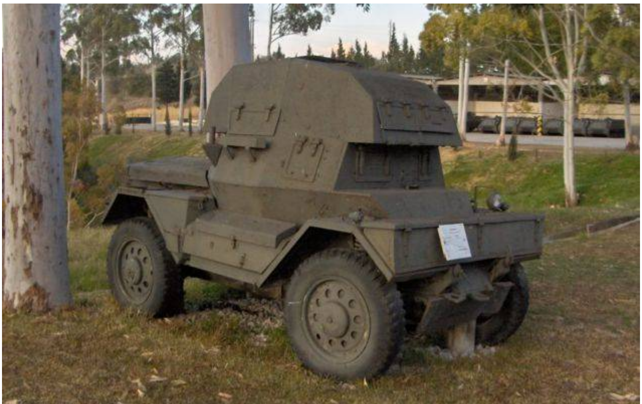
Daimler Dingo – Private Collection (France)