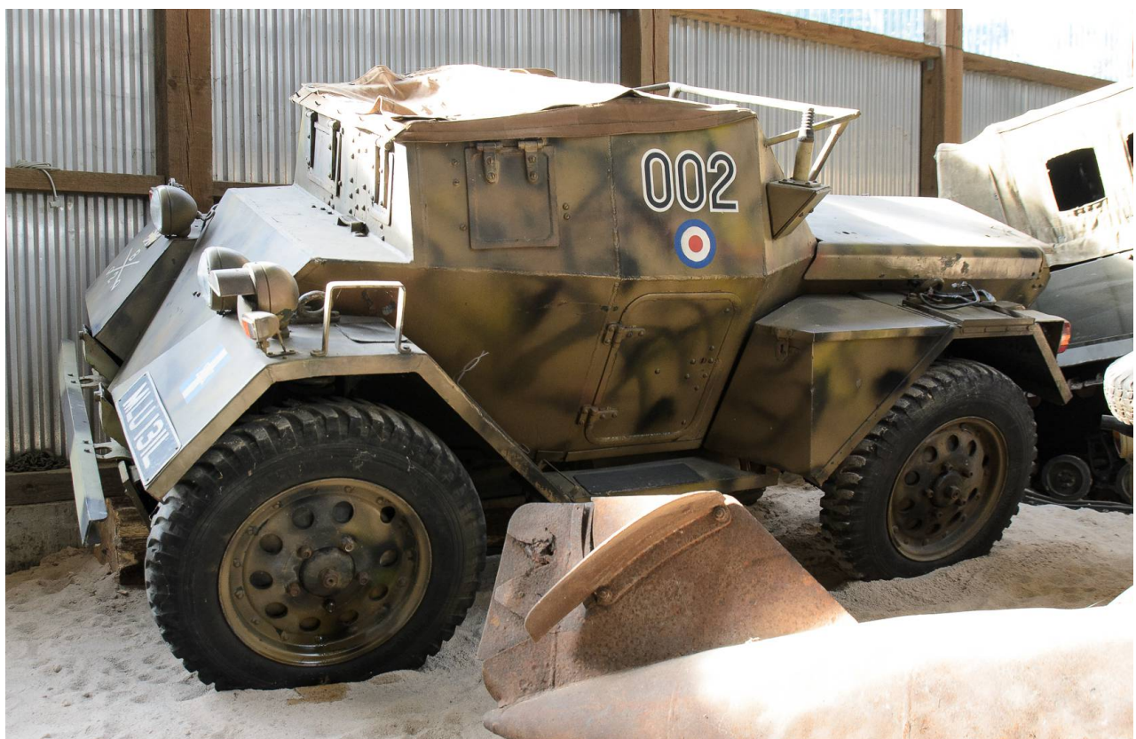
Axel Recke, September 2015