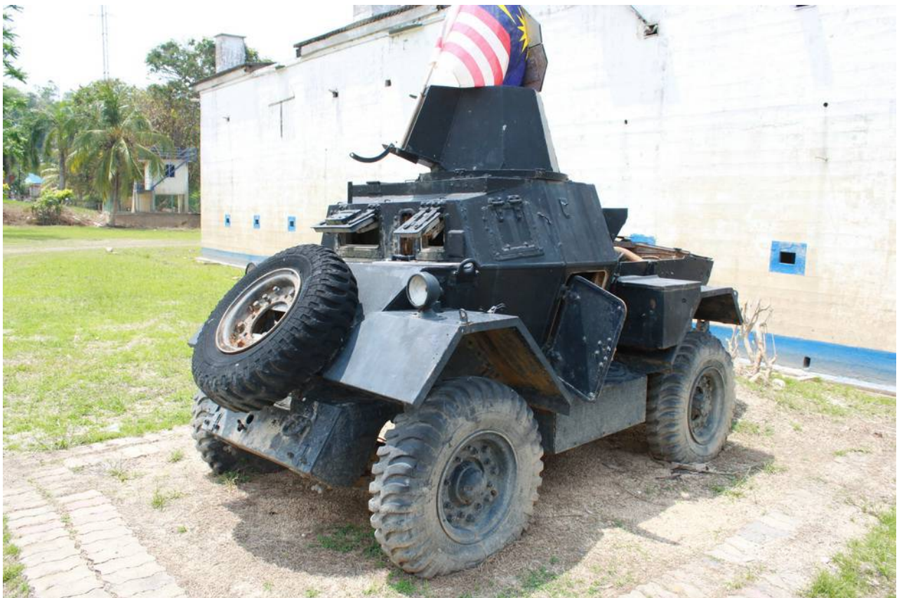
Ford Lynx – A Famosa Fortress, Malacca Town (Malaysia)

http://mp-bakri.blogspot.fr/2011/09/kenyataan-bangsa-yang-tidak-menghargai.html