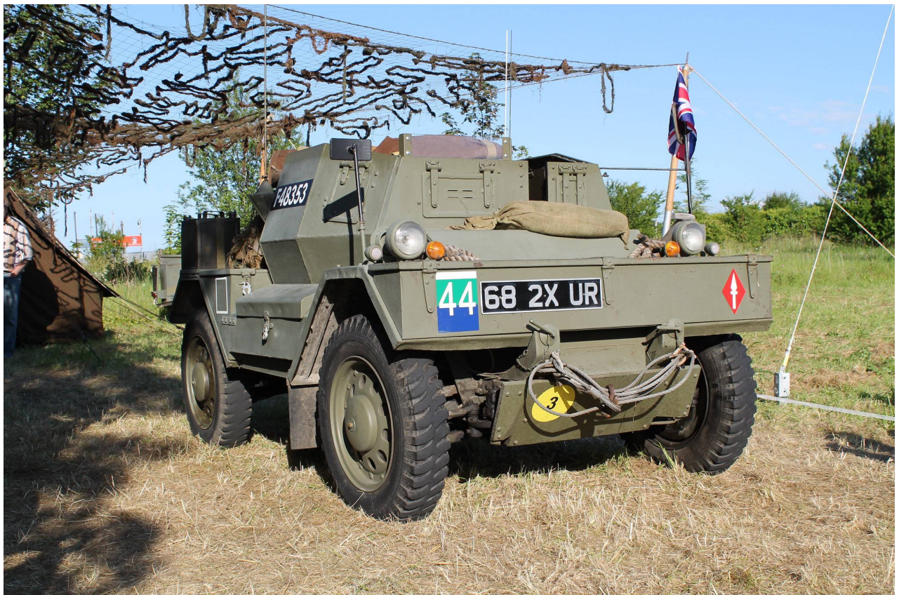
Daimler Dingo (F48241) – Private collection (UK)

Sébastien Benon, June 2013 - https://www.flickr.com/photos/37619899@N05/14214804309/