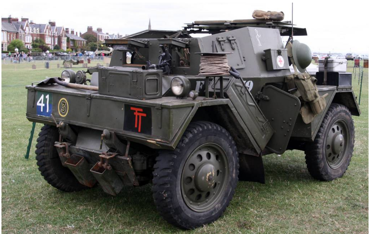
"NTG842", August 2014