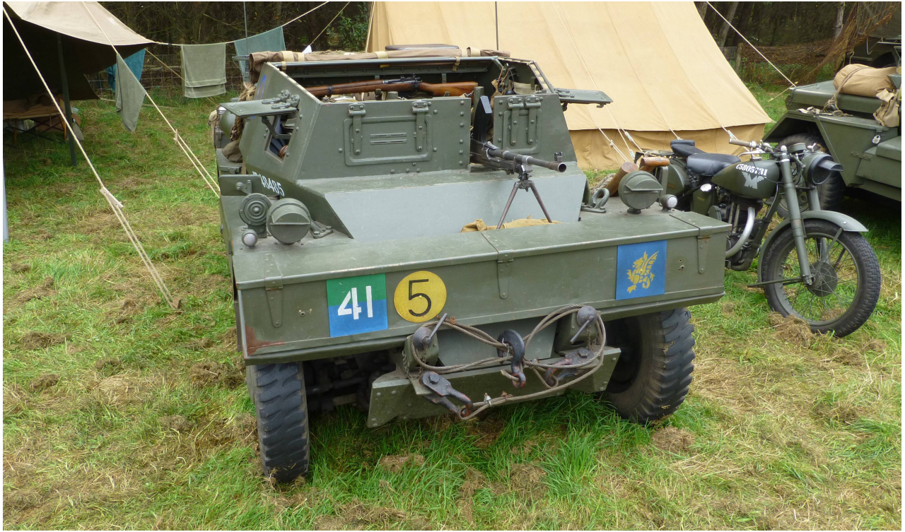
Walter Schwabe, September 2014