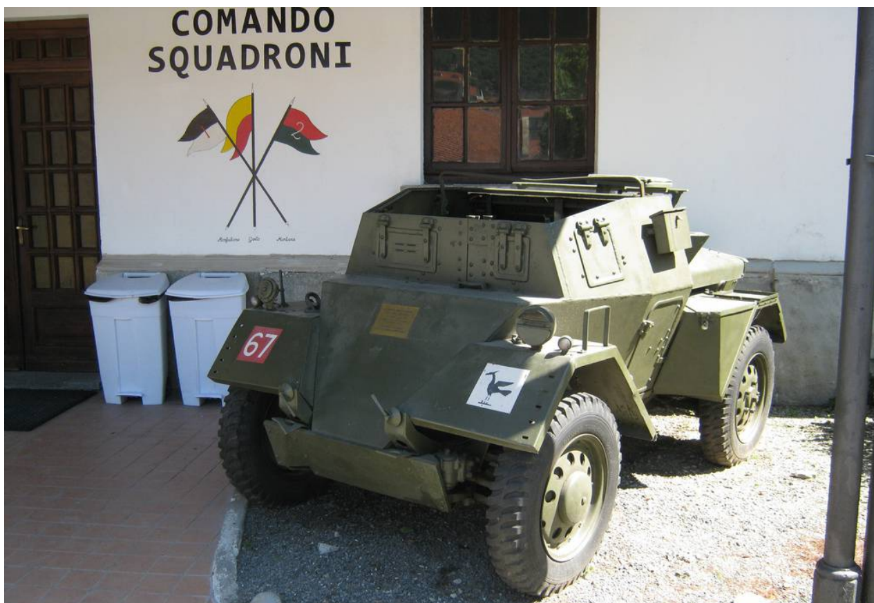
Daimler Dingo – Club LE VETERANE è federato A.S.I. (Automotoclub Storico Italiano) (Italy)

"TABS91", June 2011 - http://www.flickr.com/photos/41890777@N07/6083656030/in/set-72157627344683259