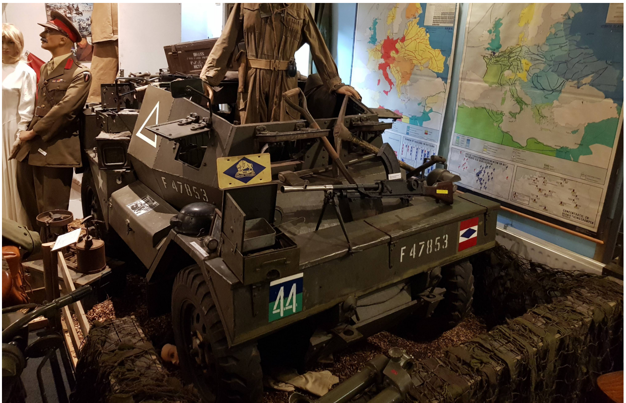
Daimler Dingo – Victory museum, Grootegast (Netherlands)

Walter Schwabe, June 2010 - http://www.mijnalbum.nl/Album=DNZUHPWY