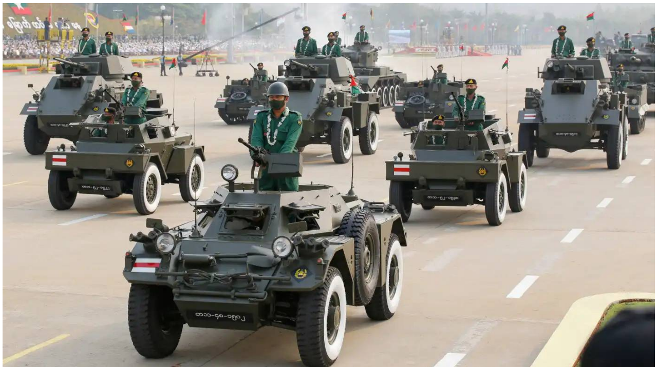
Daimler Dingo – Defence services museum, Naypyidaw (Burma / Myanmar)

https://www.facebook.com/groups/859603390775800/