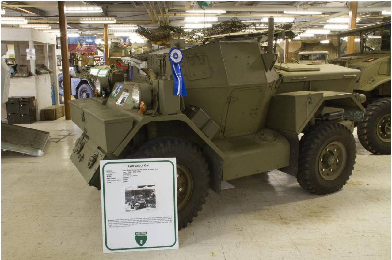
"Greeter", September 2010 - http://www.flickr.com/photos/7226432@N06/4990509904/