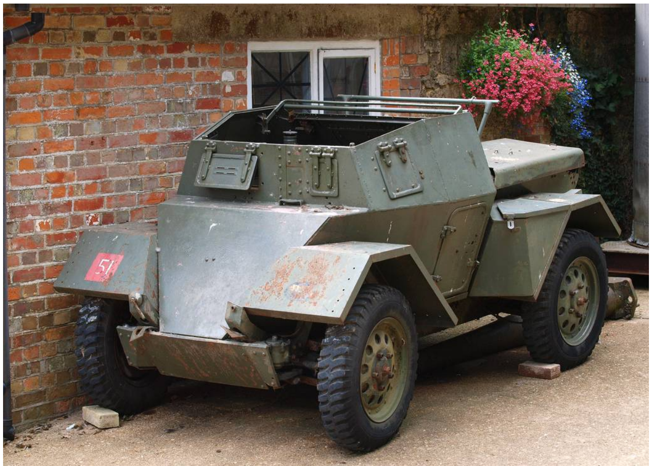
Daimler Dingo – South Midlands Military Vehicles Trust (UK)