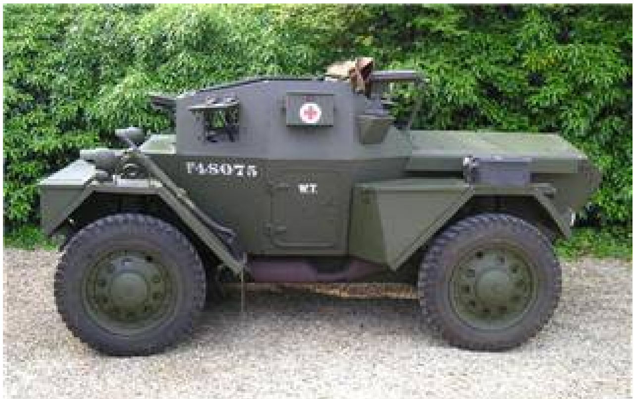
Daimler Dingo Mk III (F351119) – Private collection (UK)

http://www.daimler-fighting-vehicles.co.uk/surviving%20dsc.html