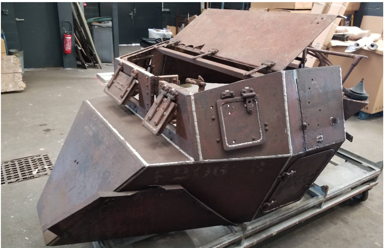
Two Daimler Dingo wrecks – Kilwaughter, Northern Ireland (UK)

https://www.flickr.com/photos/93455360@N05/16108945197/in/photostream/