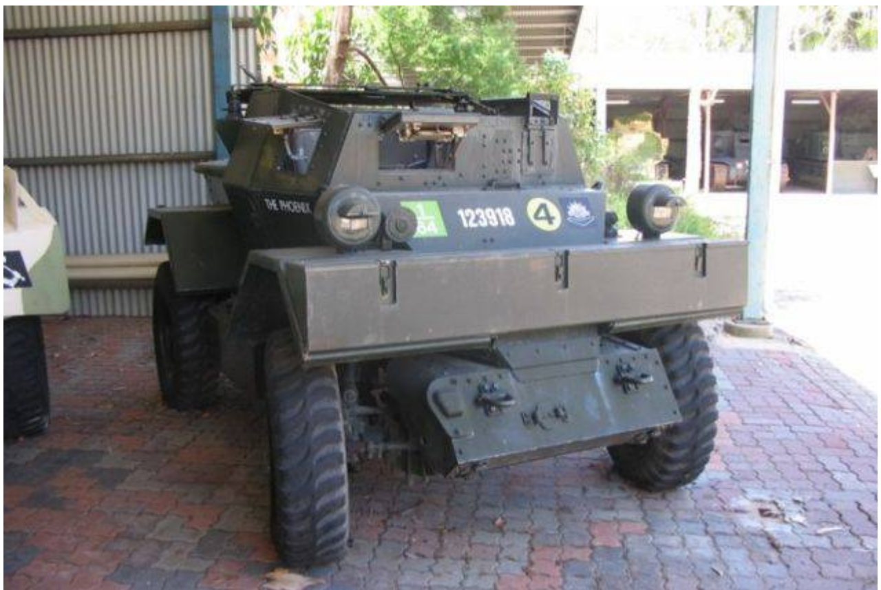
Ford Lynx – Mandala Wangsit Siliwangi Museum, Bandung, Jawa Island (Indonesia)

Brad James - http://www.warwheels.net/Lynx2JAMES.html