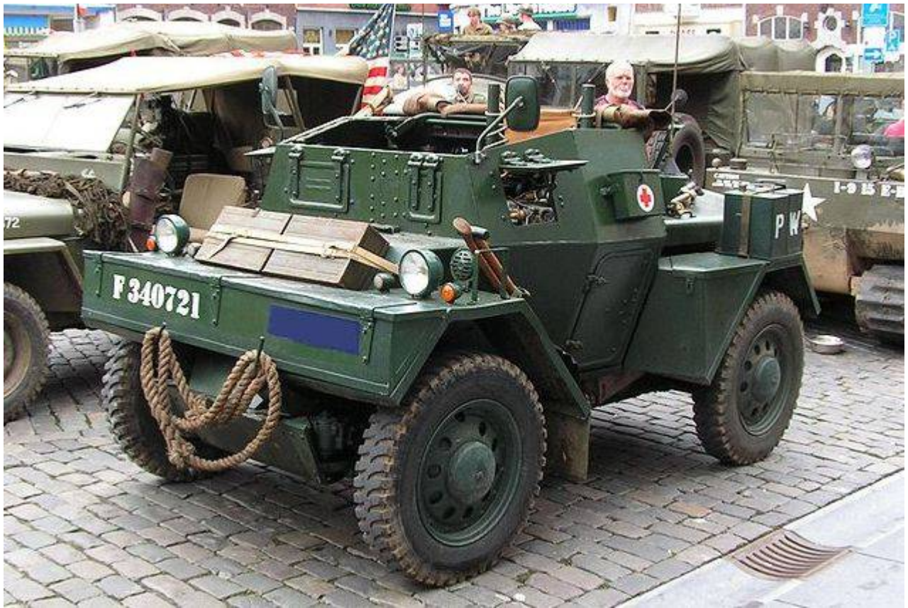
"Dammit", June 2007 - http://commons.wikimedia.org/wiki/File:Daimler_Dingo.jpeg