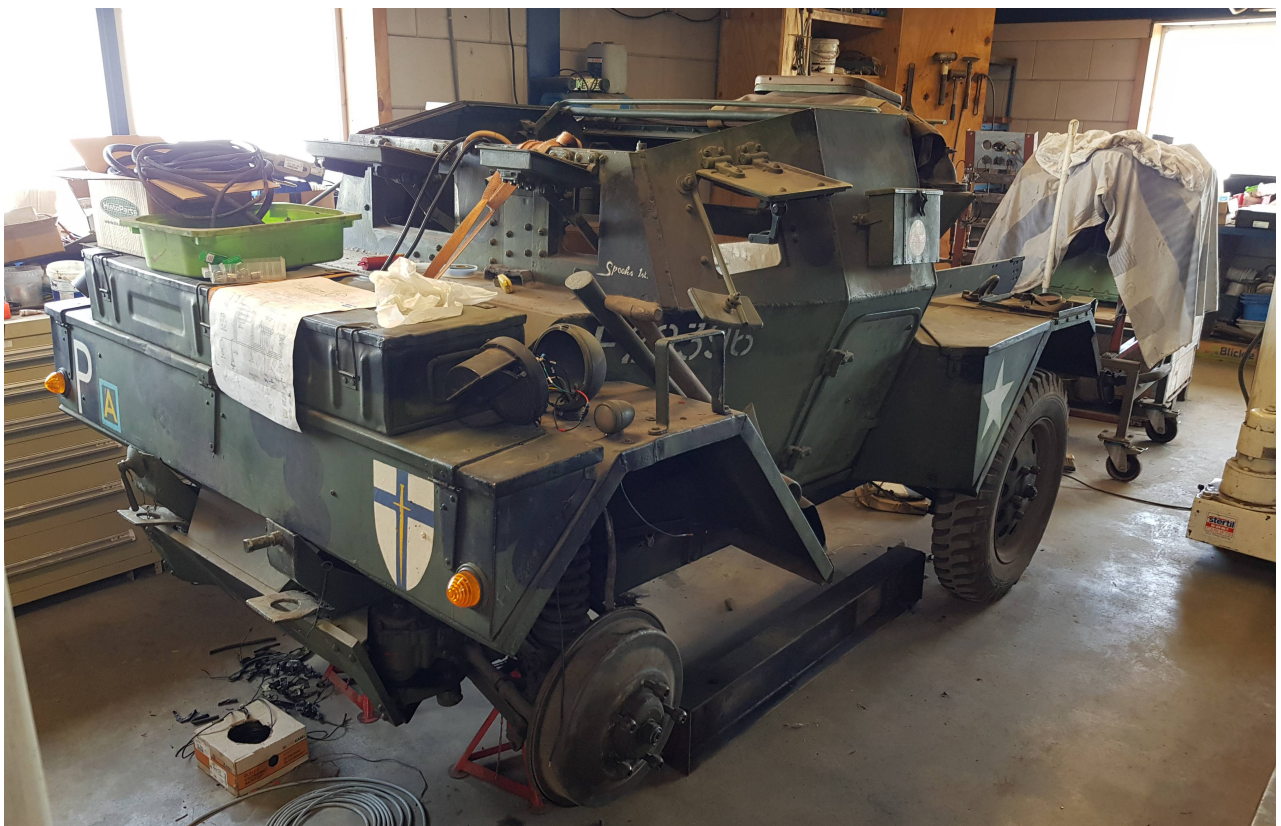
Daimler Dingo (F48177) – Private Collection, Legervoertuigen (Netherlands)

http://www.legervoertuigen.com/cpg132/thumbnails.php?album=43