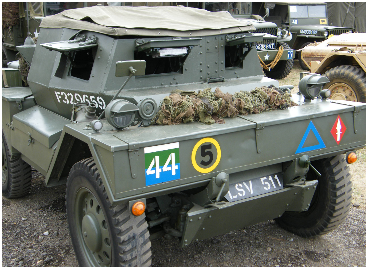
Daimler Dingo (F38784) – Private collection (UK)

http://www.daimler-fighting-vehicles.co.uk/surviving%20dsc.html