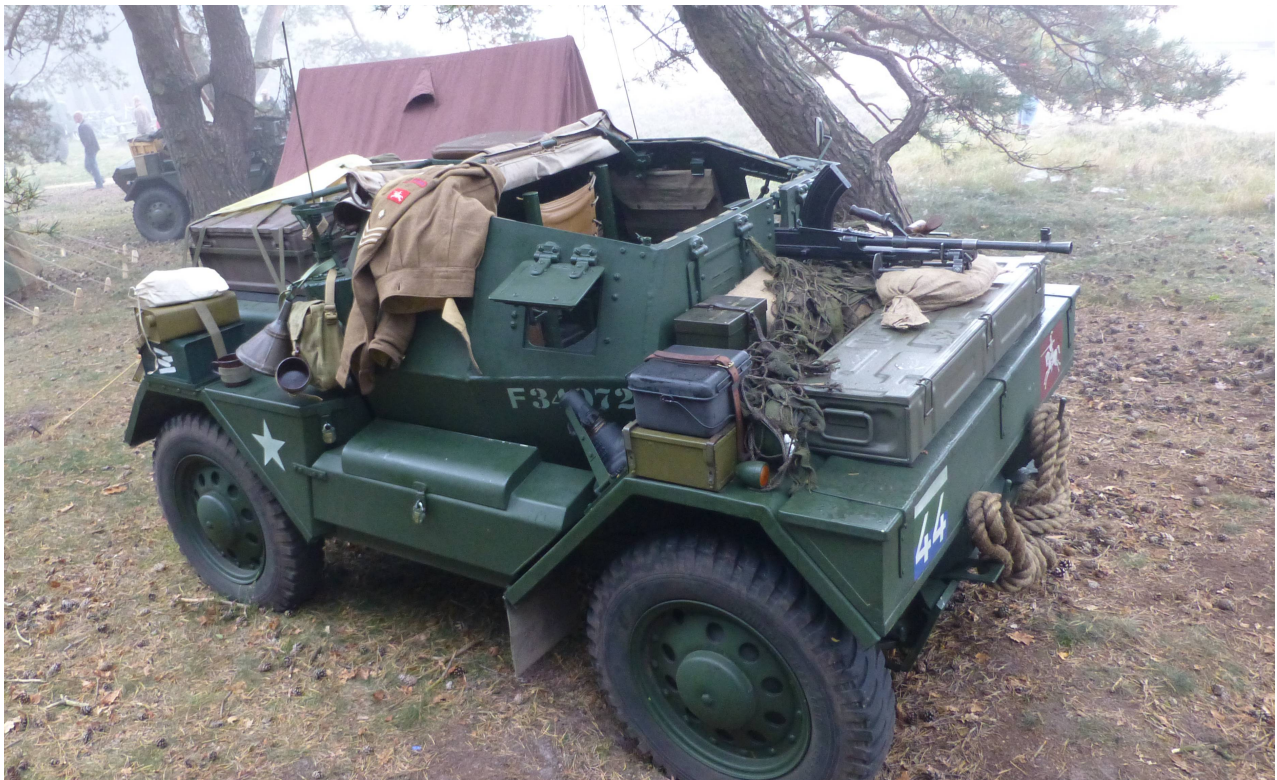
Walter Schwabe, September 2014