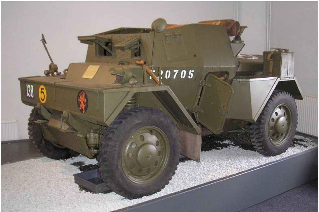
Daimler Dingo – Private collection (Germany)

http://www.com-central.net/index.php?name=Forums&file=viewtopic&t=11666&start=45