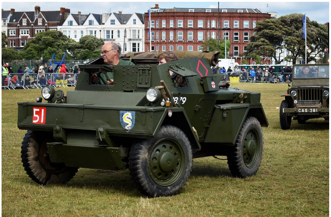
Daimler Dingo (F47927) – Private collection (UK)

"rmk2112", June 2019 - https://www.flickr.com/photos/117614565@N05/51136306355/in/album-72157709004130958/