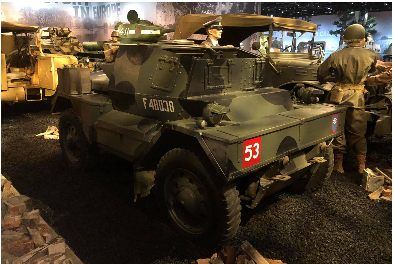
Daimler Dingo – Private Collection, Georgetown, TX (USA)

https://www.facebook.com/zach.liollo/photos