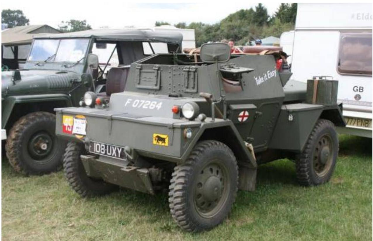
Photo taken during the Liberation Day, Guernsey (Guernsey was officially liberated from German occupation on 9 May 1945)

"ArtistsRifles", July 2008 - http://photobucket.com/images/daimler%20dingo/