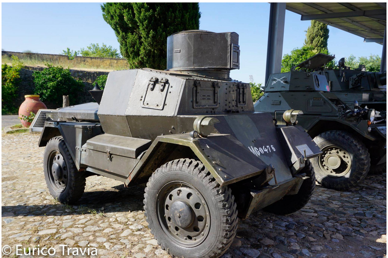
Four Daimler Dingos – Museu Militar de Elvas (Portugal)

https://www.facebook.com/photo/?fbid=2885758008312150&set=gm.5683347038404851