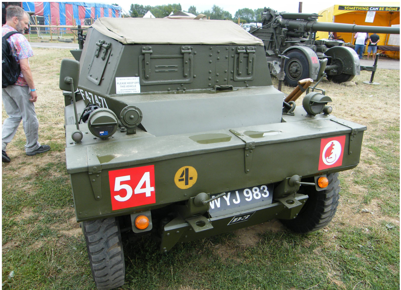
Daimler Dingo (F19720) – Private collection (UK) Formerly had painted matricule F34076

https://www.facebook.com/photo/?fbid=243076630794787&set=g.437020513037556