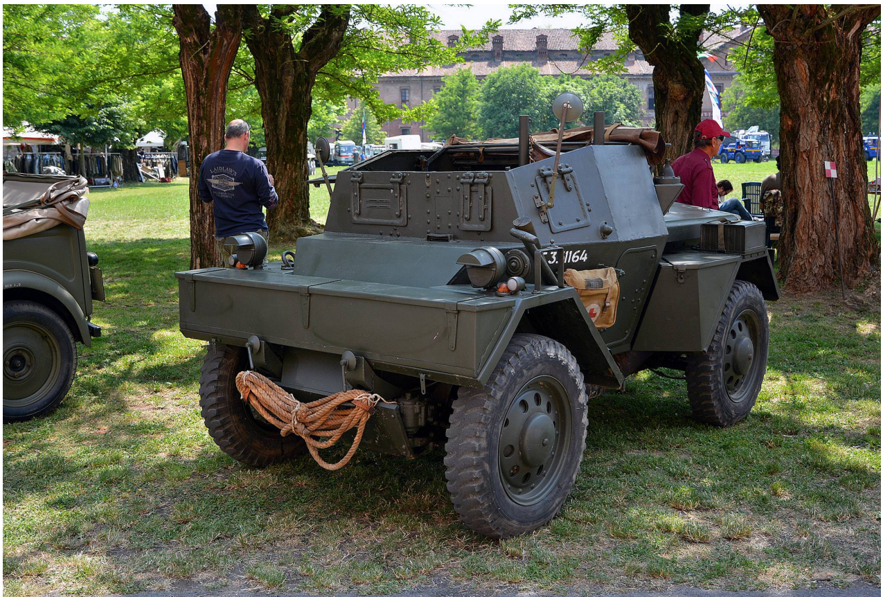
Daimler Dingo (F63592) – Private Collection (Italy)

Maurizio Boi, May 2017 - https://www.flickr.com/photos/mauboi/35551802910/