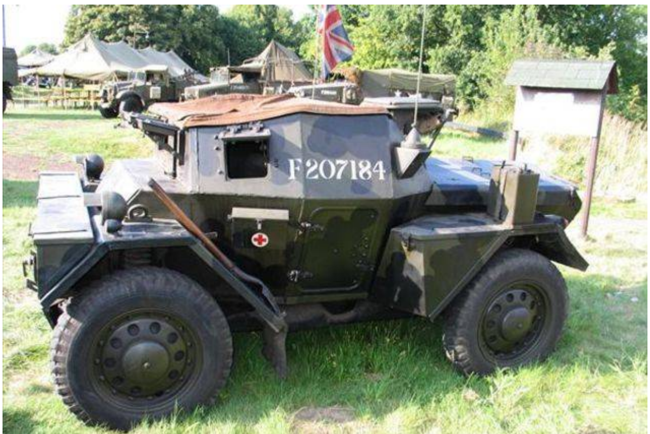
Daimler Dingo – Belgian Military Vehicles Trust (Belgium)