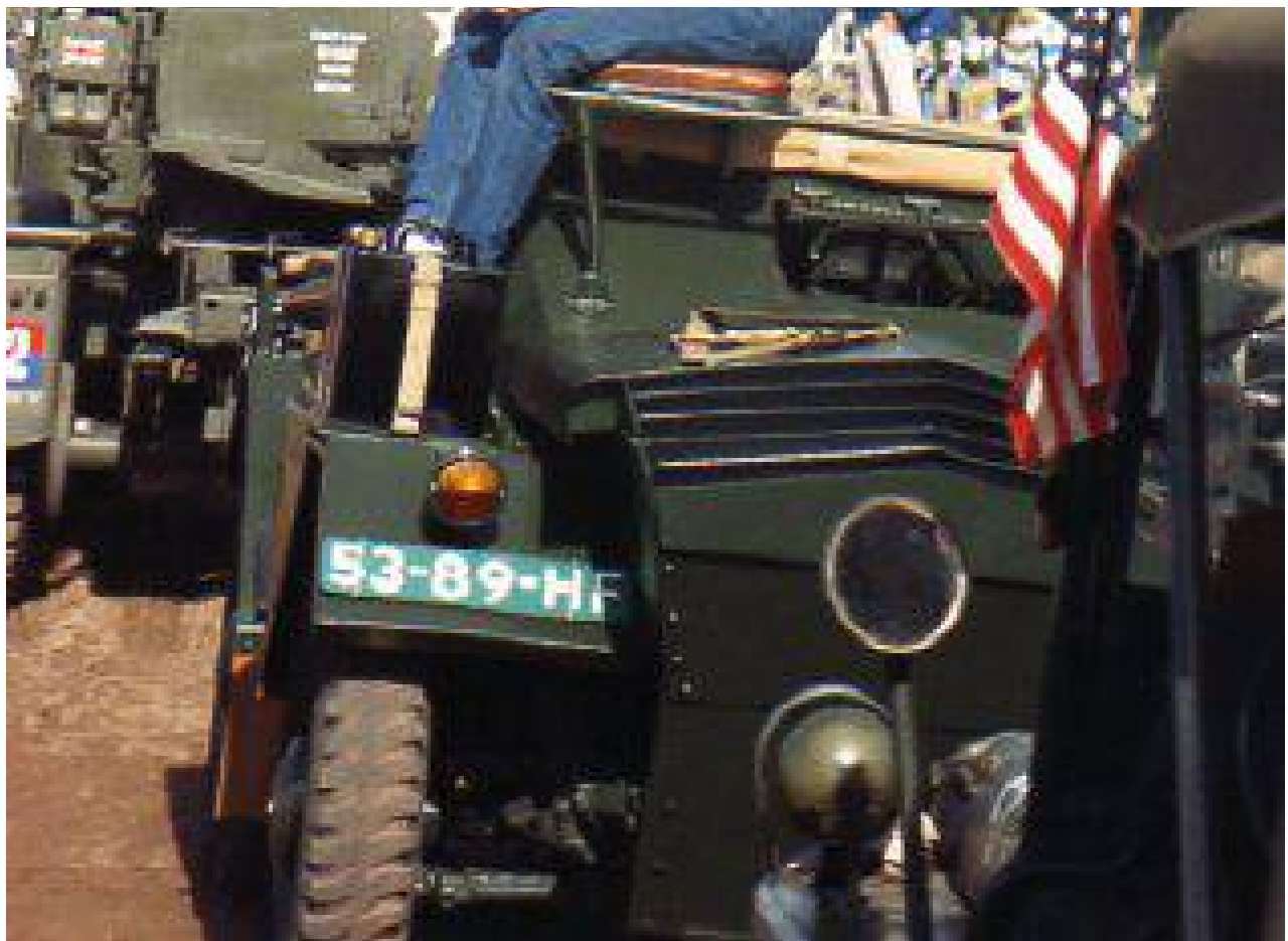
Daimler Dingo (F47818) – Private collection (Netherlands)

Picture taken at Ginkel Heath between Wolfheze and Ede at Airborne Memorial day