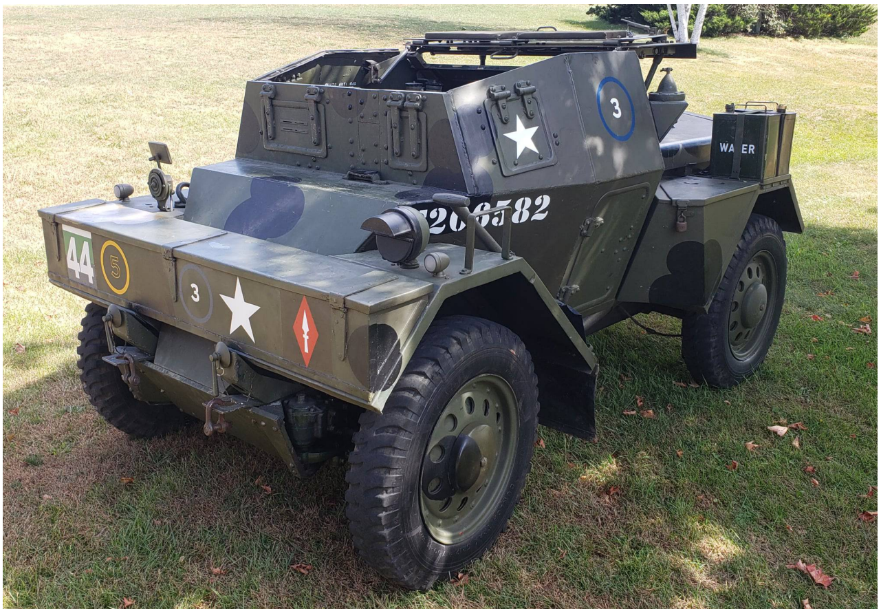
Daimler Dingo (F207130) – Private collection, OH (USA)