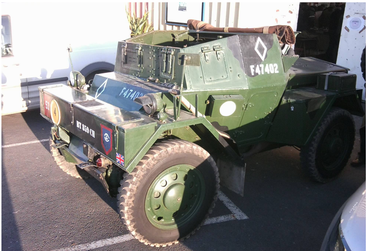
Daimler Dingo (F47483) – Private Collection (France)

http://www.daimler-fighting-vehicles.co.uk/surviving%20dsc.html