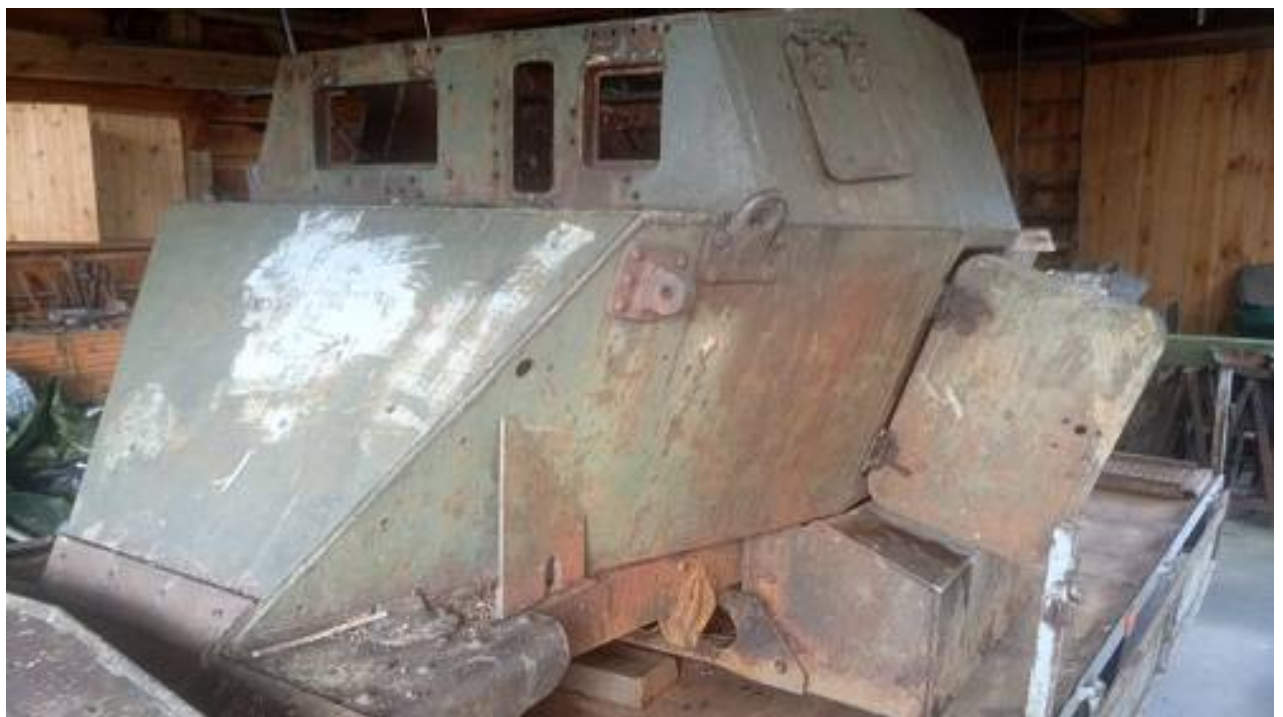
Modified Ford Lynx – Sukabumi, Jawa (Indonesia)

www.mapleleafup.net/forums/showthread.php?t=32333