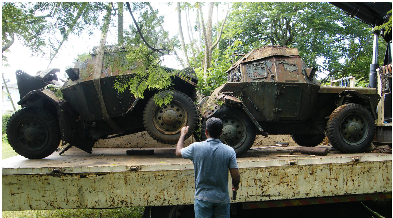
Daimler Dingo – Etimesgut Tank Müzesi (Turkey)

http://www.hobimaket.com/topic/9135-135-tsk-tanklari-ismet-g%C3%BCralp/