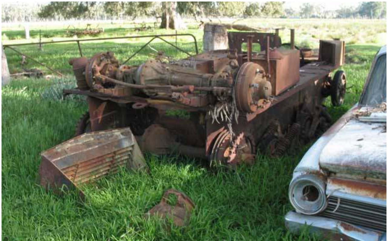
Ford Lynx wreck – Rick Cove Collection (Australia)

http://www.imagecontrol.com.au/oldcmp/bennie_2.html