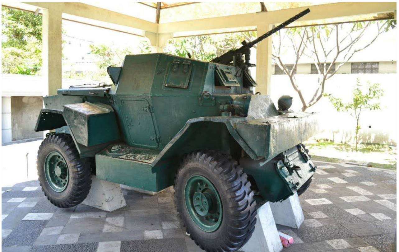
Ford Lynx – Kodam VII Wirabuana, Makassar (Indonesia)

https://www.youtube.com/watch?v=PyL2Kw3PY8o