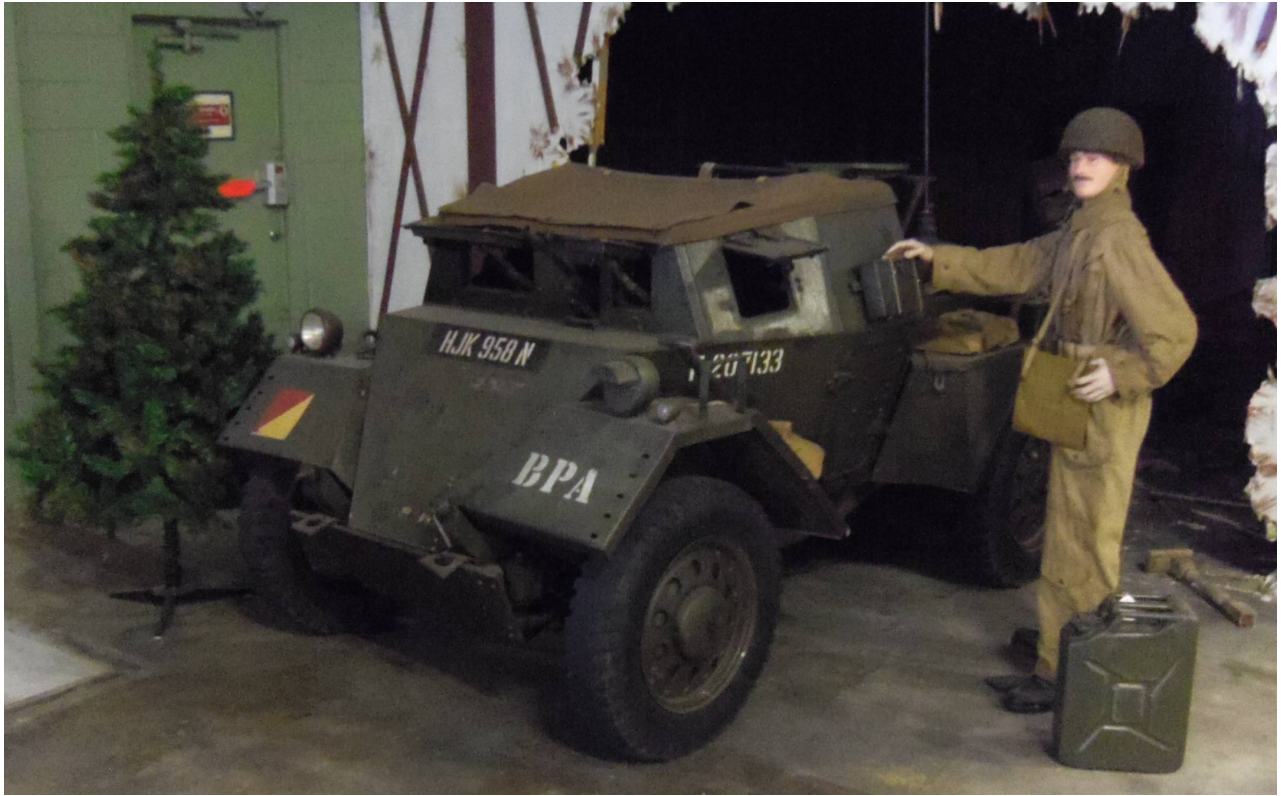
Pierre-Olivier Buan, September 2016