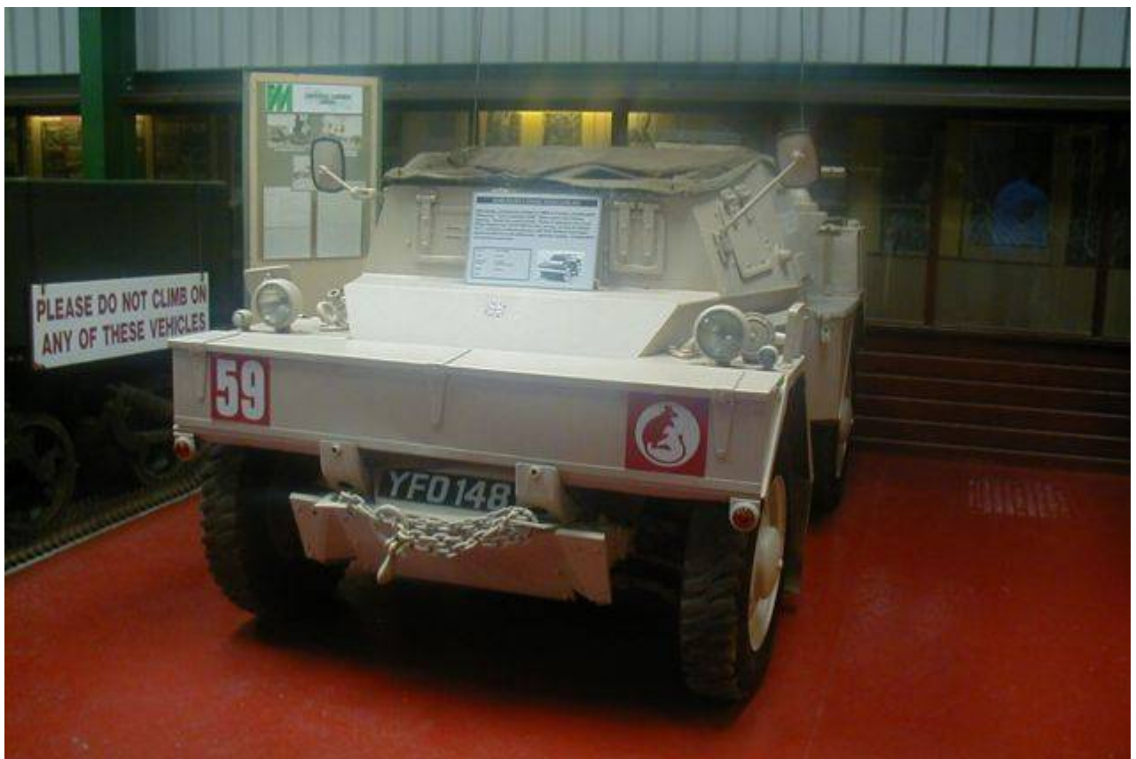
Daimler Dingo – D-Day Museum, Portsmouth (UK)

"alexdrean", May 2007 - http://www.flickr.com/photos/31074376@N06/3277901621/