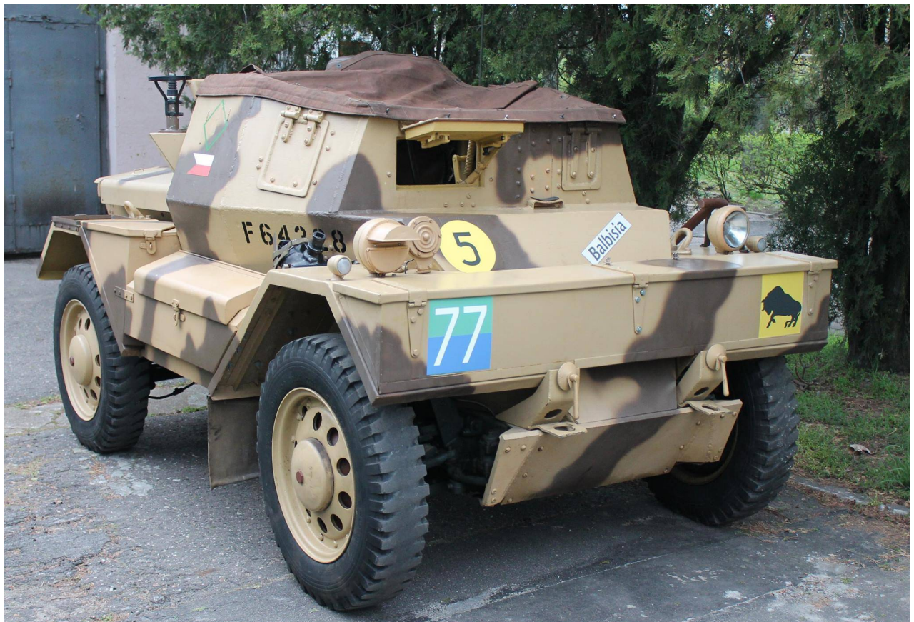
Daimler Dingo – Private Collection (Italy)

https://www.facebook.com/MBPanc/photos/a.219017158117922.65227.149612871725018/1545850528767905/?type=3&theater