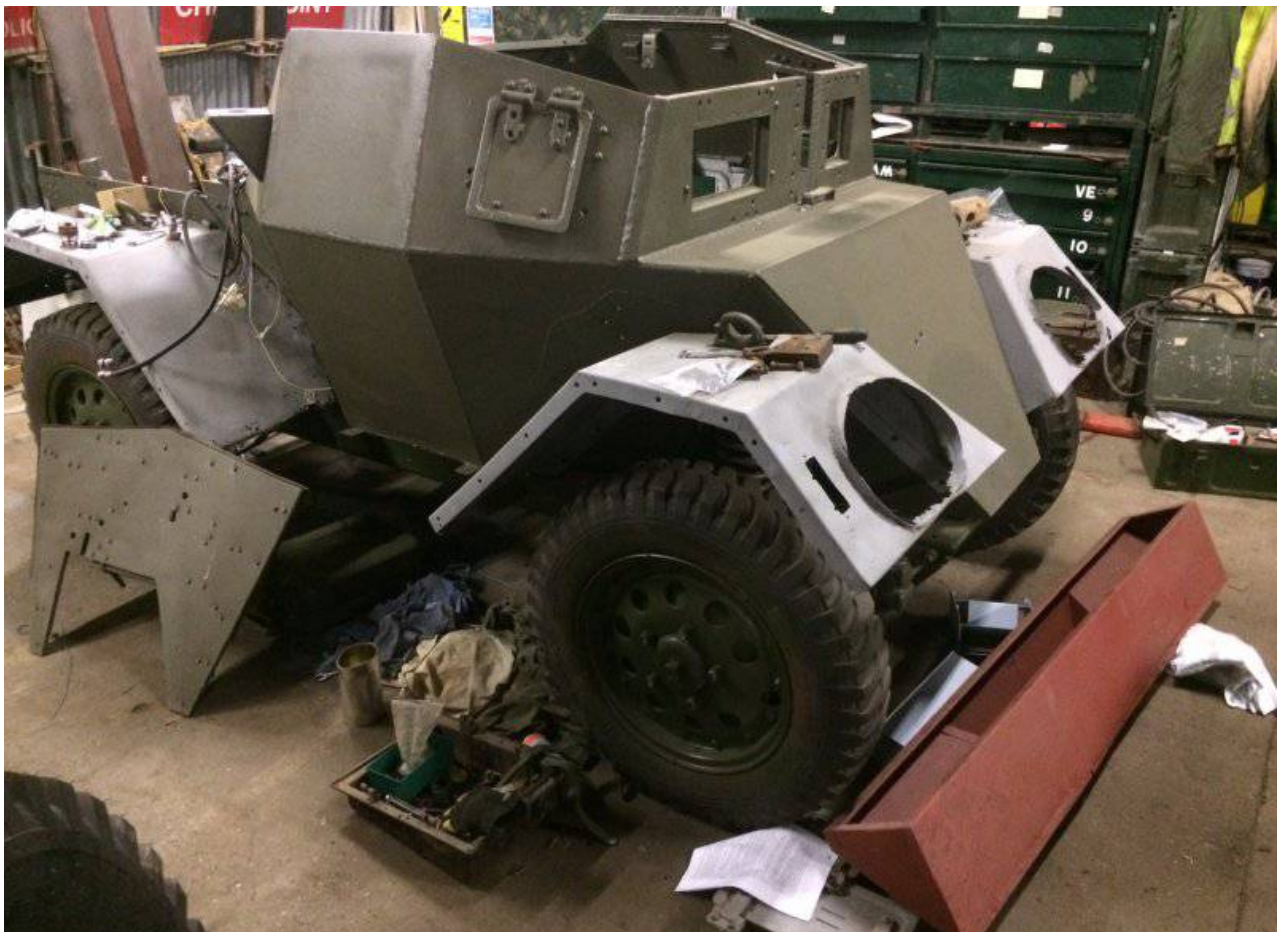
Daimler Dingo (F205473) – Private collection (UK) Seen at War and Peace Revival 2016

Ian Tong, 2016 - https://www.flickr.com/photos/iant-tanks/40049249190/in/photostream/