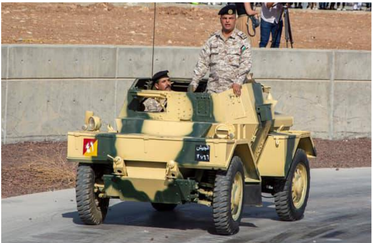
Ford Lynx – Underground Prisoners Museum, Jerusalem (Israel)

https://www.facebook.com/TankMuseumjo/photos/a.1957685424560083/2395572507438037/?type=3&theater