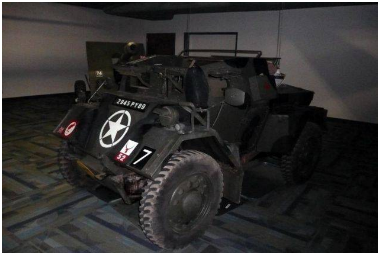
Vladimir Yakubov - http://svsm.org/gallery/Fighter_Factory/P1210236