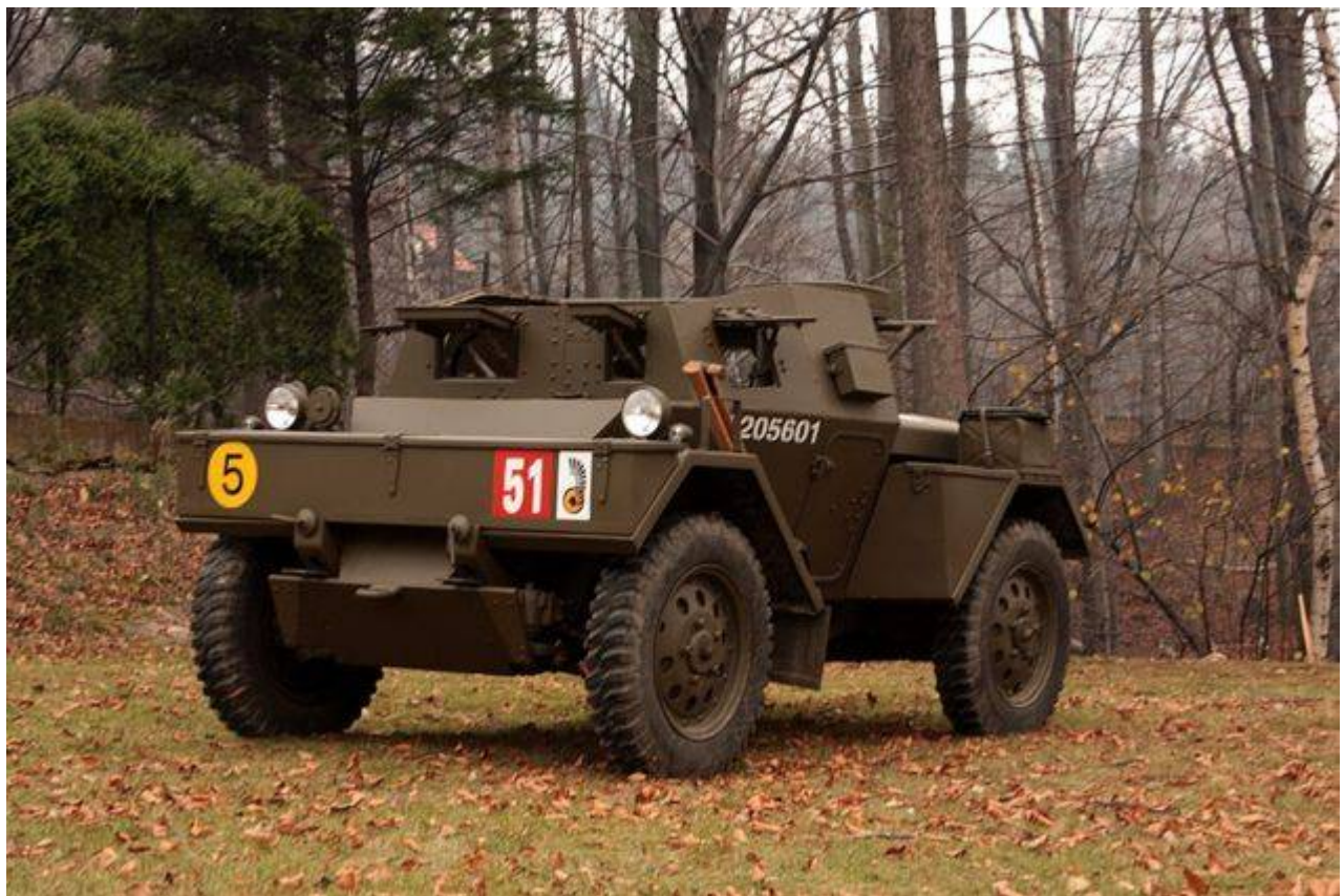
Daimler Dingo – Land Forces Museum, Bydgoszcz (Poland)

http://www.militaria.bielsko.com.pl/park.php