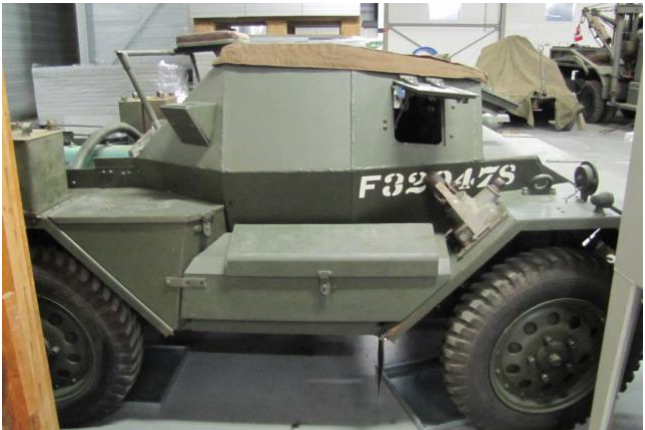
Daimler Dingo (29 ZS 29) – Private collection (UK)