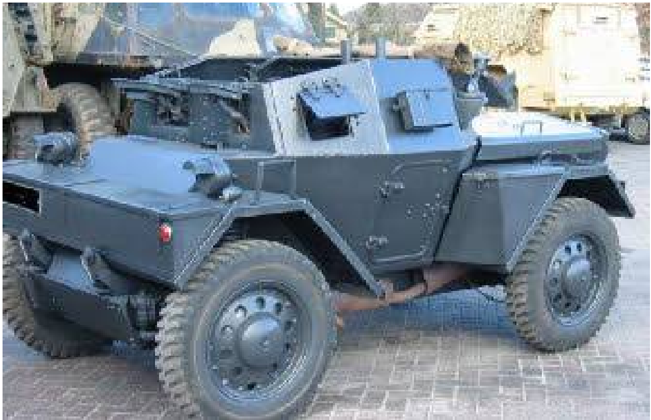
Daimler Dingo (F48569) – Private collection (UK)

http://www.daimler-fighting-vehicles.co.uk/surviving%20dsc.html