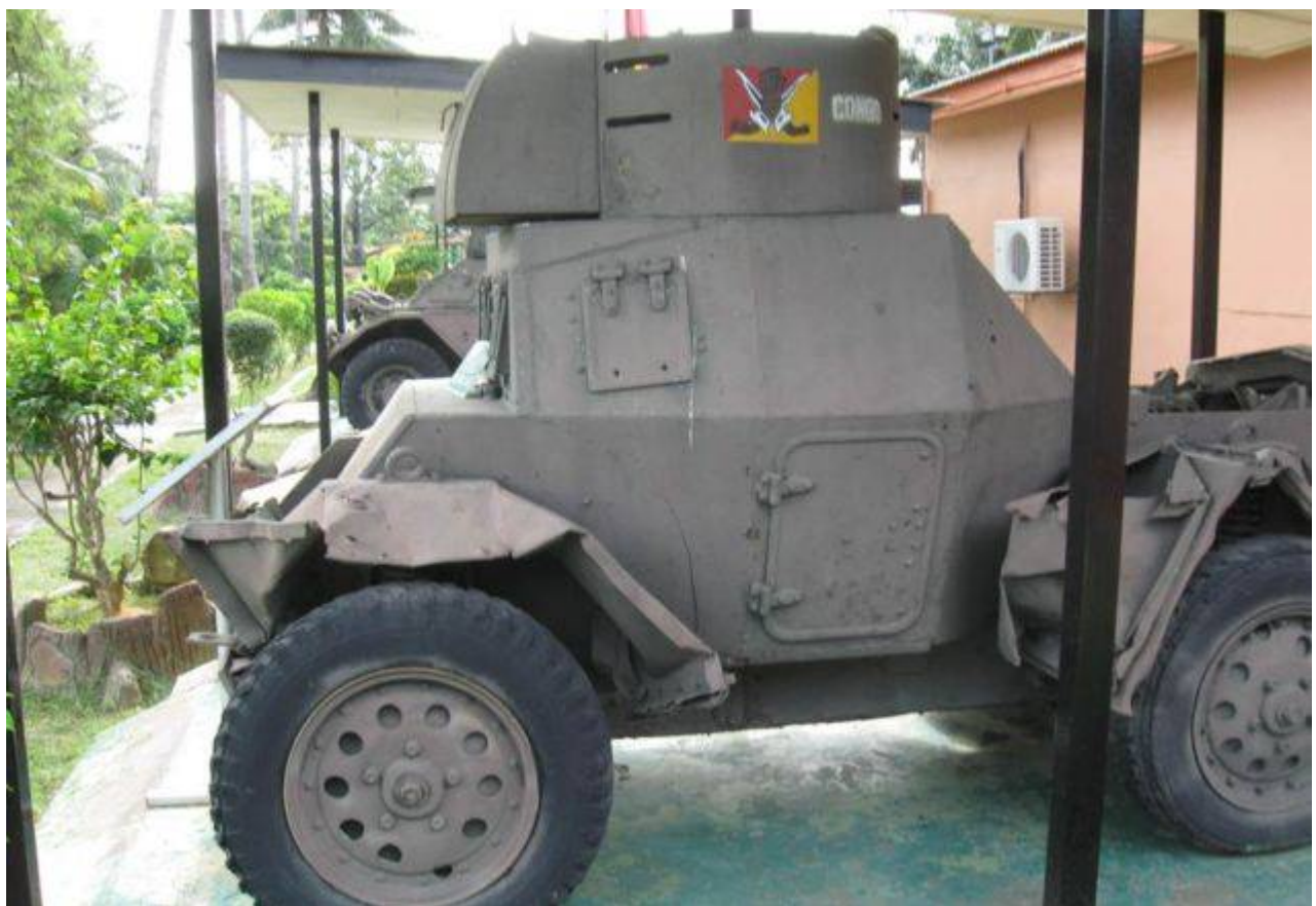
First Daimler Dingo – Malaysian Army Museum, Port Dickson (Malaysia)