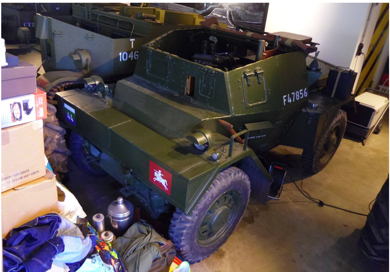
Daimler Dingo "Taurus Pursant" (F48544) – Private Collection (Belgium)

William Testaert - http://www.warwheels.net/DaimlerDingo2INDEX.html