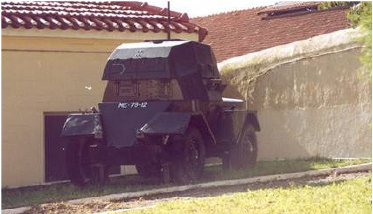
Daimler Dingo – Military Museum, Porto (Portugal)