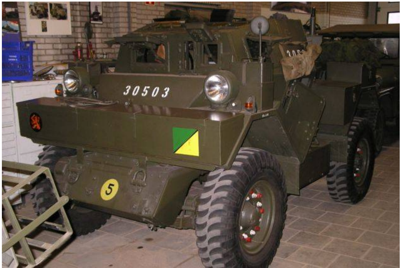
"Olaf", December 2007