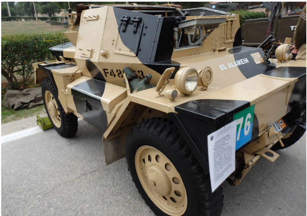
Daimler Dingo (F48652) – Handmet Military, Gostyń (Poland)

https://www.facebook.com/photo.php?fbid=10210094592855171&set=pcb.10154021335450069&type=3&theater