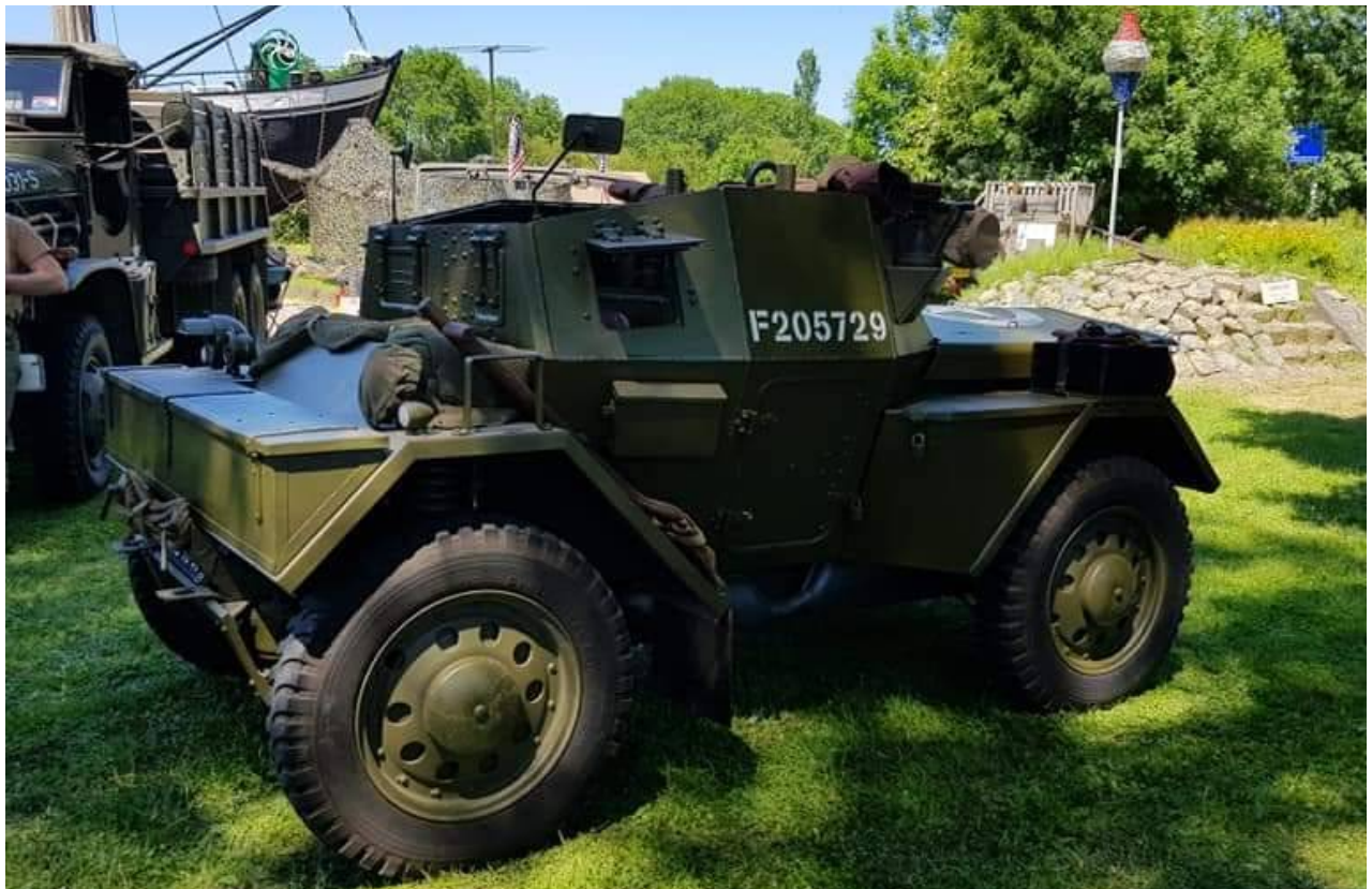
Daimler Dingo – Private collection (Netherlands)

https://www.facebook.com/groups/437020513037556/permalink/5715710008501887/