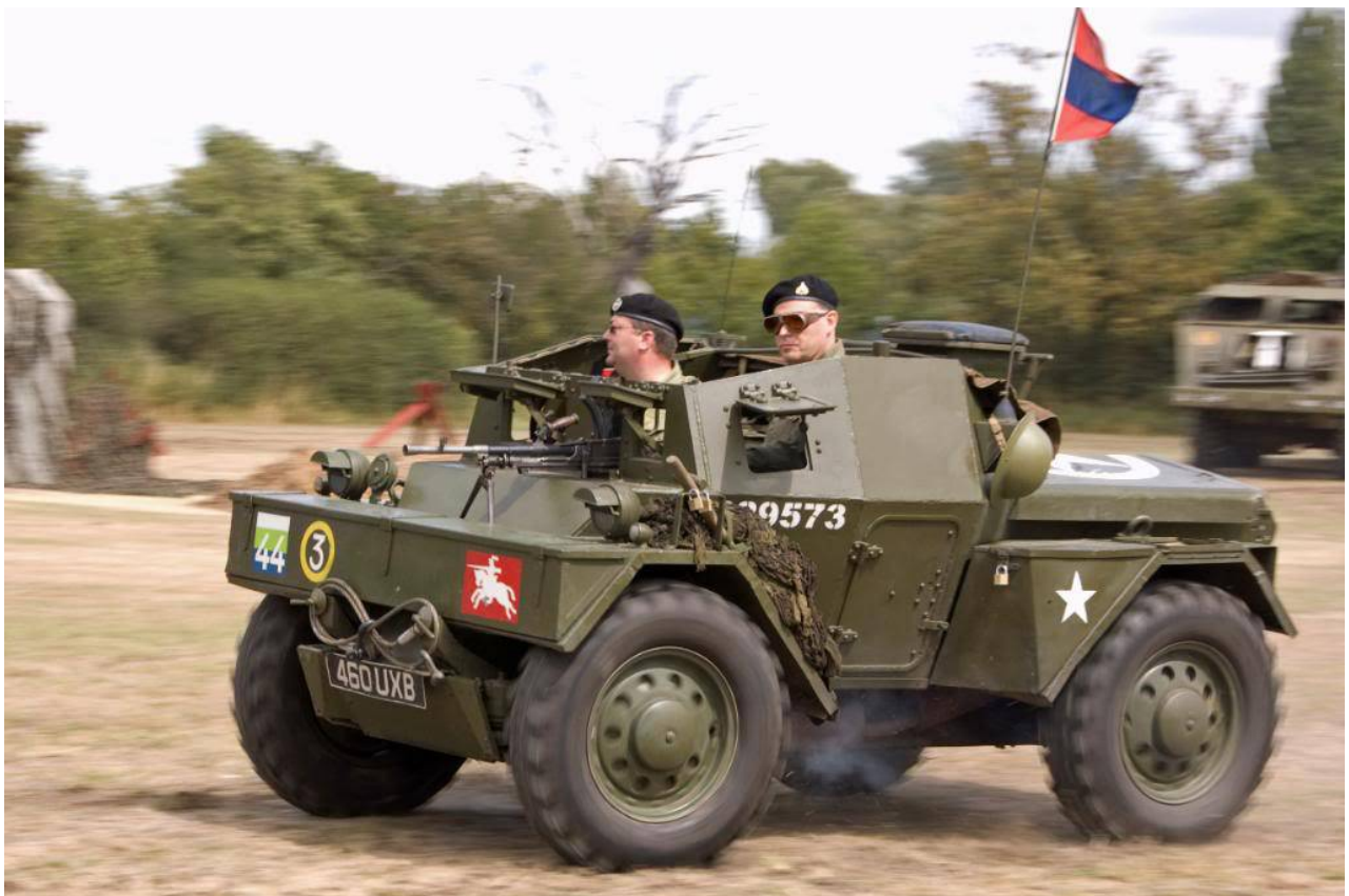
"Alpha Delta 210", August 2010 - http://www.britmodeller.com/forums/lofiversion/index.php/t59878.html

Photo taken during the Scottish Transport Extravaganza 2008 at Glamis Castle