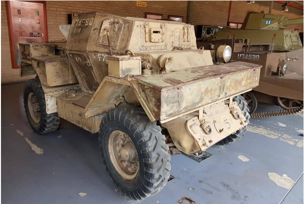
Pierre-Olivier Buan, March 2020